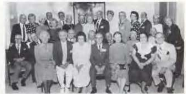
Class of 1939