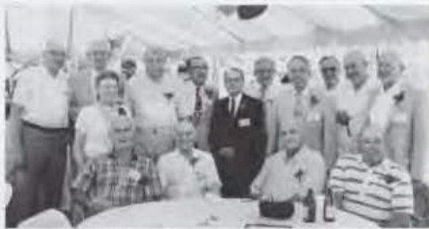
The Class of 1939 during the afternoon festivities.

Whatever happened to ...? In case you're wondering what became of that 'old gang of mine', just take a look at these photographs and see who you recognize. Alumni attending the May 20th Alumni Day Festivities at New Bolton Center spent a beautiful sunny afternoon reminiscing about the good times, followed by an evening of reunion dinners and dancing. Many thanks to all who helped make Alumni Weekend a success.