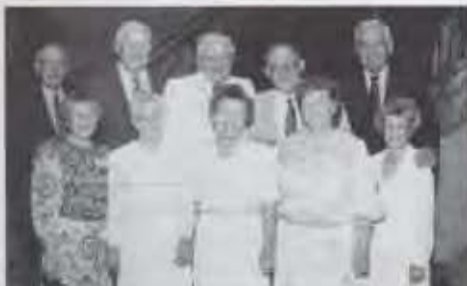
Class of 1944