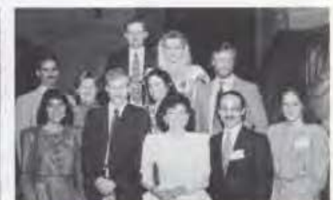
Class of 1984