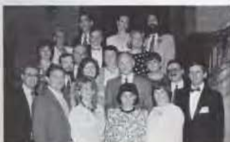
Class of 1969