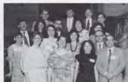
Class of 1979