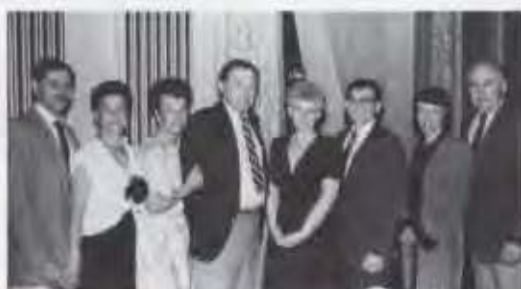
Class of 1974