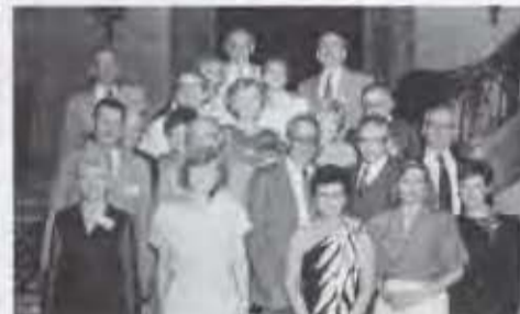
Class of 1959