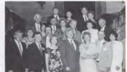
Class of 1964