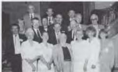
Class of 1954