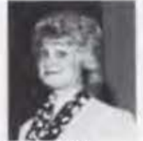
A.J. Buck & Son, Inc.