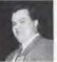
Hills Pet Products