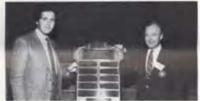
Dermatologic for Veterinary Medicine, Inc.