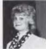
A.J. Buck & Son, Inc.