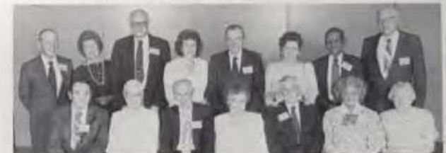
Class of 1948