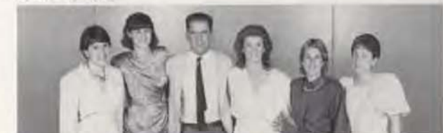
Class of 1983