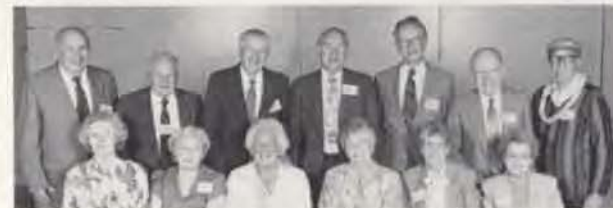
Class of 1943