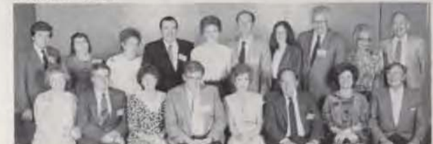
Class of 1958