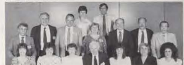
Class of 1963