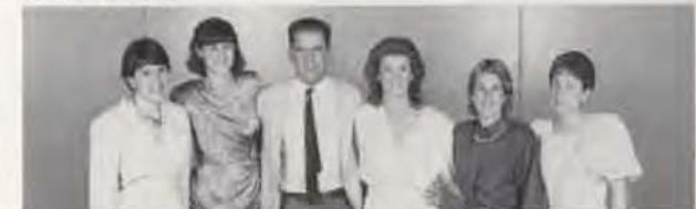
Class of 1983