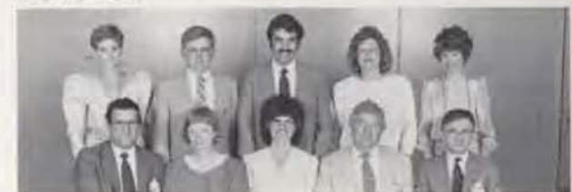
Class of 1973