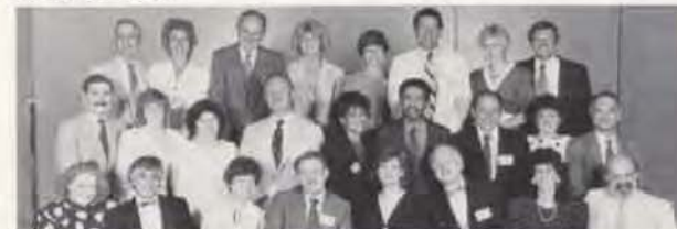
Class of 1968