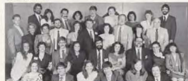
Class of 1978