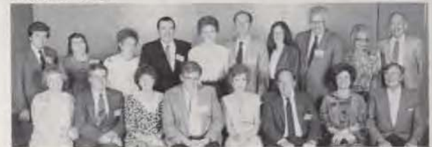
Class of 1958