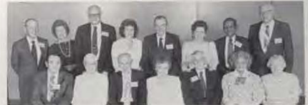
Class of 1948