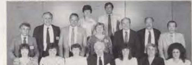
Class of 1963