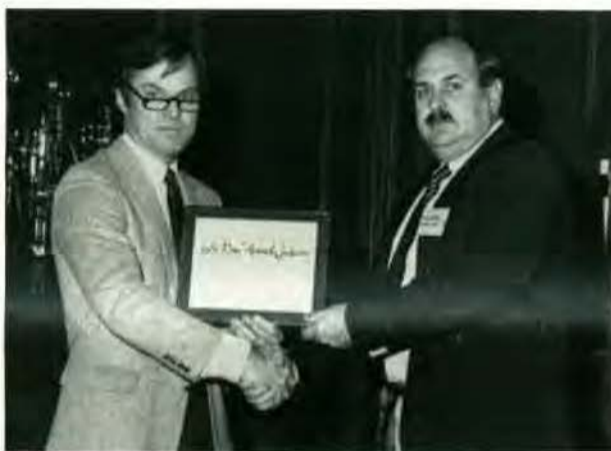
Daniels Pharmaceuticals, Inc.