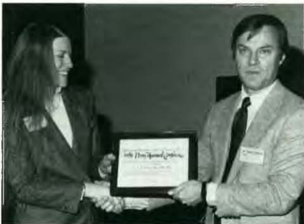
A.J. Buck and Son, Inc.