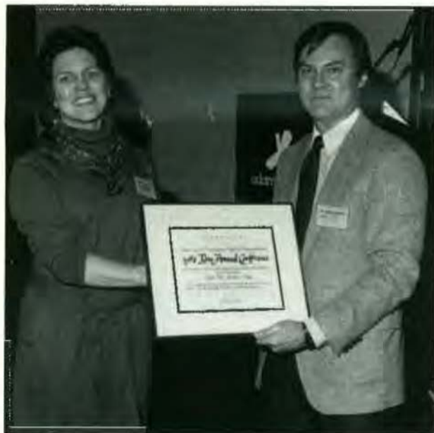
ALPO Petfoods, Inc.