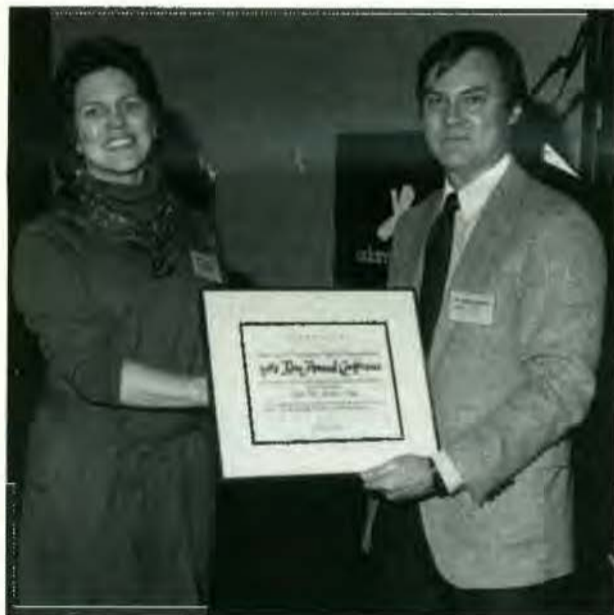
ALPO Petfoods, Inc.