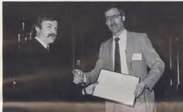
E. I. DuPont Nemours and Co., 1987 PAC Patron