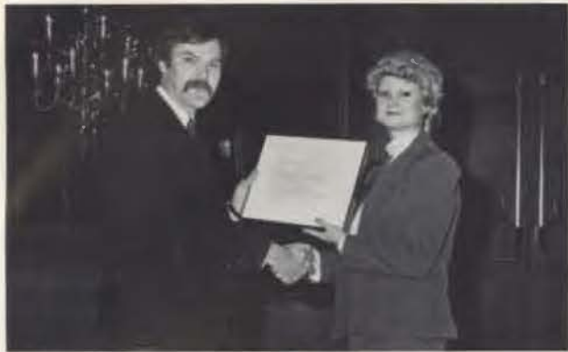
A. J. Buck and Son, Inc., 1987 PAC Patron