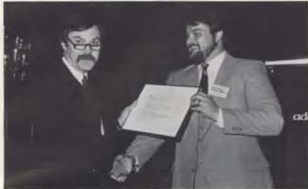
Peterson Imaging, Inc., 1987 PAC Patron