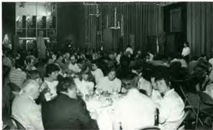
Participants enjoying the complimentary lunch

gram, including a three-course lunch, was provided at no cost to the 200 practitioners in attendance. Penn is proud to have been chosen by Gaines Foods, Inc. to co-host this year's symposium.