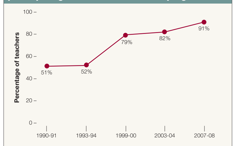
FIG. 2. Trends in the percent of beginning teachers participating in induction or mentor programs

Not surprisingly, our data indicate that over the past couple of decades, the number of induction programs also has grown considerably. The percentage of beginning teachers who report that they participated in some kind of induction program in their first year of teaching has steadily increased in recent