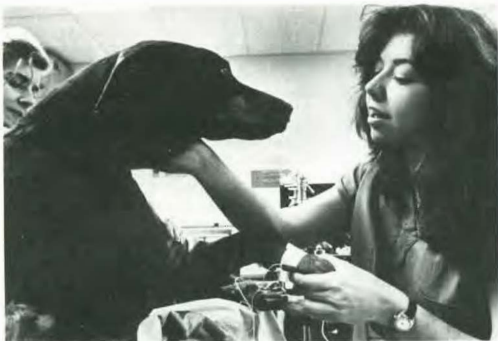
Bruiser, a seven-year-old Doberman undergoes his eighth weekly treatment for lick granuloma by acupuncture.