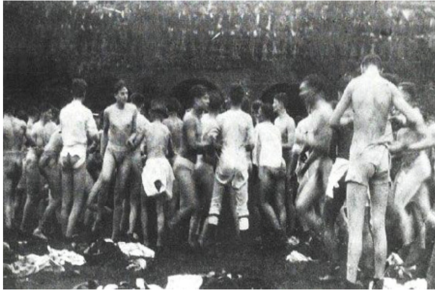
Students at the University of Pennsylvania engaged in the annual Pants Fight to show their class pride. 40

Several of the rituals at Penn became so popular that they drew spectators from the city of Philadelphia to the campus. However, the level of rowdiness was sometimes difficult to contain, and there were a few occasions when such events brought negative attention to the school. Such was the case with the annual “Pants Fight,” an end of the year event that started in 1922 in which freshmen and sophomores engaged in a brawl, culminating in the losers being stripped of their pants. 41 In May 1923, when a group of enthusiastic freshmen publically advertised this fight by appearing on a trolley car wearing only their undergarments, “they drew gasps of horror from maids and matrons by trying to board a Woodland Avenue trolley car in which girls and women were passengers,” and they were promptly arrested for their indiscretion. 42 School administrators valued inter-class rivalries, which expanded in the 1920s, as a way of promoting class unity and school spirit. In fact, the annual “Flour Fight” and “Poster Fight,” which were physically dangerous (sometimes resulting in concussions and broken bones), were routinely at-