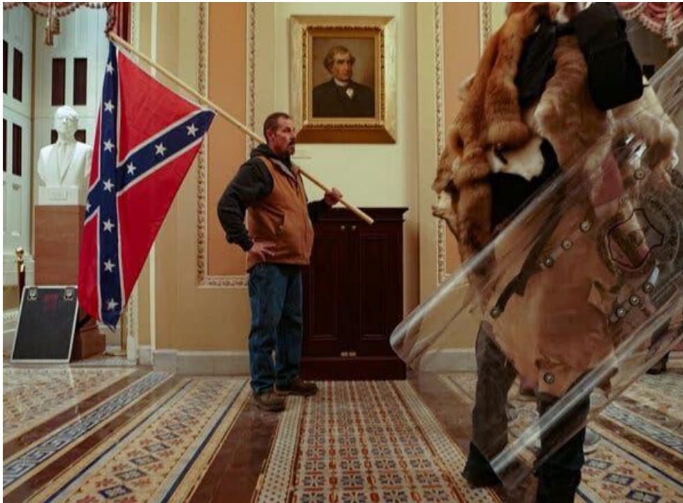
Fig. 3. “Insurrectionist holds Confederate flag in front of portrait of Charles Sumner”

This photograph from January 6, 2021 [below] is thus an allegory begging to be read for its disturbing contrasts: a Confederate-flag yielding insurrectionist stands in front of a politician who spoke against slavery and was beaten for it. But it is an image of the Dantean punishment of cowardice, where a man carries a flag—the flag of a non-entity, the Confederacy, that is followed by too many—in front of a man who knew that text well. Dante’s poetic vision unfolds here before our eyes and those of Sumner.