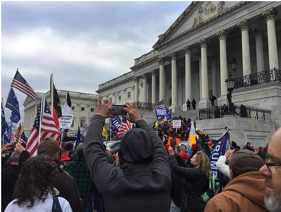
Fig. 1. Storming of the US Capitol on January 6, 2021

Though these examples misappropriate Norse, Germanic and Crusader history, politicians and leaders of the alt-right in other countries have similarly reclaimed their medieval past as a part of their revisionist narratives. Fascists of the early 20th century dis-torted Dante Alighieri, 14th century poet of the Divine Comedy , into Italy's idyll of patriotic glory. Far-right politicians of today have followed in these footsteps , as when Matteo Salvini cited the brutalized appearance of the Prophet Muhammed in Inferno 28 as part of his anti-immigration speech in Florence in 2016.