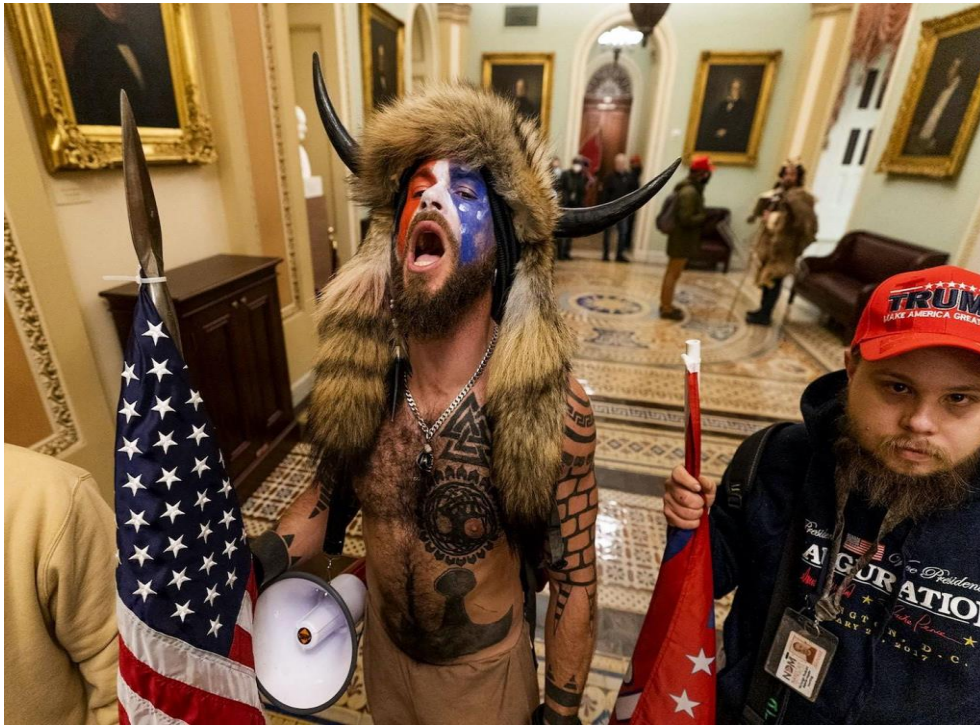
Fig. 2. “ Jacob Chansley, aka Jake Angeli, inside the Capitol on January 6, 2021 ”

treason from Dante's Inferno . In canto eleven, Dante the pilgrim arrives in the first ring of the Seventh Circle, which punishes those souls who were violent against their neighbors. Here, tyrants, murderers, and bandits—those who are violent to others or their property—are immersed in the Phlegethon, a boiling river of blood, to various degrees: the worse the sin, the further immersed the soul in the river.