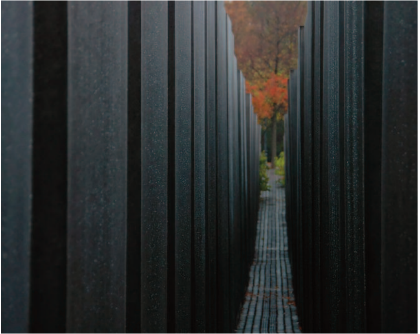
Memorial to the Murdered Jews of Europe (2005). Peter Eisenman. Berlin, Germany