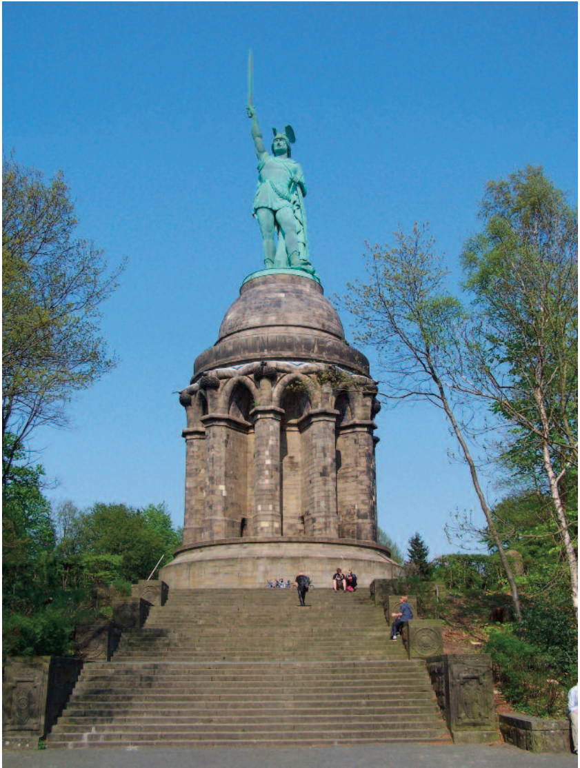
The Hermann Monument (1841-1875). Ernst von Bandel Grotenburg, Germany