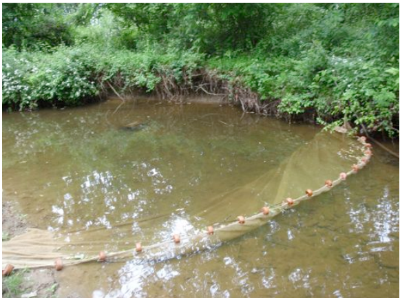
Figure 3: Mesh net spanning White Clay Creek, PA

A 50 meter reach in each branch was chosen and included a combination of pools and riffles. The same reach was sampled in the East Branch in both June and October, but in the Middle Branch the sample reach was moved downstream about 100 meters to avoid a hard-to-sample pool. Fish movement into and out of the sample reach was restricted by placing 6 mm mesh nets (Figure 3) across the upstream and downstream ends of the reach. Fish were captured using backpack electrofishing equipment (Smith-Root LR-24 and ETS ABP-3Q-600) as seen in Figure 4.