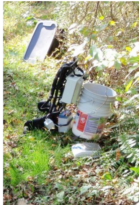
Figure 4: Electrofishing backpack

At each site we measured species composition, abundance, density, biomass and productivity. We collected fish from each stretch and estimated abundance using the 3 pass equal effort depletion method (Hayes et al. 2007). All specimens collected were identified to species, weighed, and measured (fork length). Scales were taken from selected size ranges for age determination. Pictures were taken of fish that could not be