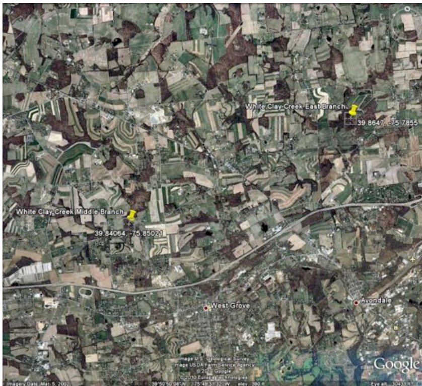
Figure 2: Map of sites' proximity to each other