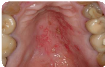
FIGURE 2. Recurrent intraoral herpes (RIH) of the palatal mucosa.

at the mucocutaneous junction of the lips (known as a fever blister or cold sore) (FIGURE 1). A majority of patients experience prodromal symptoms preceding an episode of RHL, which often consists of pain, itching and/or burning at the site of lesion development. 6 Recurrent intraoral herpes (RIH), which is observed more often in immunocompromised patients, may be difficult to distinguish clinically from other oral mucosal disorders, such as aphthous stomatitis (FIGURE 2). Prodromal symptoms preceding an episode of RIH are not commonly observed. 6 Management of recurrent herpes infections is dependent upon frequency, severity and distribution of lesions and may include topical and/or systemic therapeutic agents.