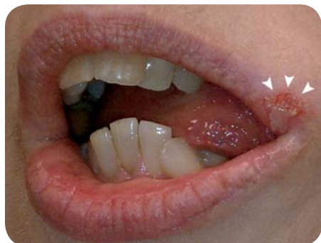
FIGURE 1. Typical presentation of recurrent herpes labialis (RHL) (white arrows).