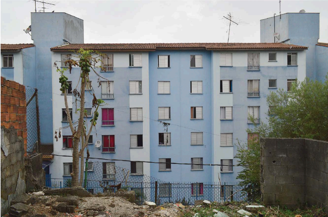
Figure 2: A housing project built near São Mateus neighborhood after years of advocacy from the Movement to Defend the Favelado.

Back in São Mateus, other housing activists were emphatic about the historic entwinement of multiple collective consumption demands. In a cramped, dark garage, Silva helped another family build its own cistern, while a longtime housing organizer told me of the thirty years it had taken her neighborhood movement to get the city government—with federal financial help—to pave the roads in their informal community, regularize their land titles, and build new, safer housing to protect inhabitants from floods (see Figure 2). The cisterns would help. But it had taken decades just to get a decent connection to SABESP’s network of pipes. Their latest triumph was a local daycare center. For these activists, there was a sharper division between government neglect and mobilized democracy than between decent housing, supported by public services, and a SABESP utility bill. This is a politics of collective consumption, where symbols and services, social and ecological goods are knotted together and anchored by housing.