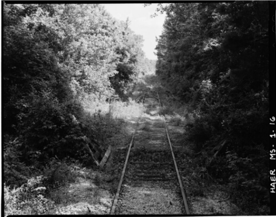
Figure 1: D. K. Gleason, "16. Mile Post No. LB 40.0, Cattle Guard viewed from the north. West Feliciana Railroad Right-of-Way, Woodville, Wilkinson County, MS," 1979. Photograph from the Historic American Engineering Record (HAER).

Parallel lines of steel stretch toward the horizon, interrupted by overgrowth and dappled shade. Half-hidden below the center of the photographic frame, a pair of triangular wings rises at a 45-degree angle from the railroad tracks into the encroaching brush. Between them is a horizontal grid of wooden and metal bars. This arrangement of bars constitutes what is variously called, depending on one's location in the English-speaking world, a cattle guard, cattle grid, or stock grid. The bars are spaced such that the hoof of any would-be bovine or ovine trespasser can easily slip into the shallow pit between them. The aim is to prevent livestock from even attempting to cross. Similar to the granite coffin stiles used for centuries in Cornwall, cattle guards are Maxwell's demons for living things, keeping cattle and sheep on one side of a fence or wall while