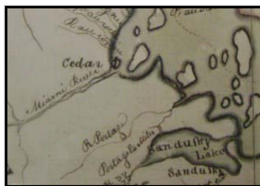
– Detail of the place of treaty negotiation showing both the Miami River and Sandusky.

For nearly a decade after the American Revolution, the territory beyond the Ohio River was a constant source of conflict between the United States, Native American polities, and European governments. By late 1792 a series of military confrontations and separate agreements left both the United States and several of the most powerful Native American coalitions at an impasse. As Washington’s government in Philadelphia prepared for war to enforce US claims to the trans-Ohio it also could not afford to ignore an invitation to negotiate a settlement. In late 1792 an assembly of American Indian groups (with British backing) invited the US to negotiate terms for a peace which would set firm boundaries for further territorial claims [1]. The meeting eventually took place at Sandusky, Ohio but was originally slated to occur on the Miami [known today as the Maumee ] River near present-day Toledo [2]. The map then likely dates to the spring of 1793 when the final location of the meeting had yet to be set.