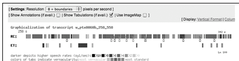
Figure 5: Screenshot showing an excerpt of a transcript graphicalization

Who talks when, and in response to whom? Do the interviewers and interviewees accommodate to one another over the course of the interview (in terms of variable productions, speech rate, gap length, etc.)? This sort of view of the data can help motivate answers to these questions and importantly allows us to see speech data in a more holistic way than traditional transcription or tabulation presentation methods have allowed.