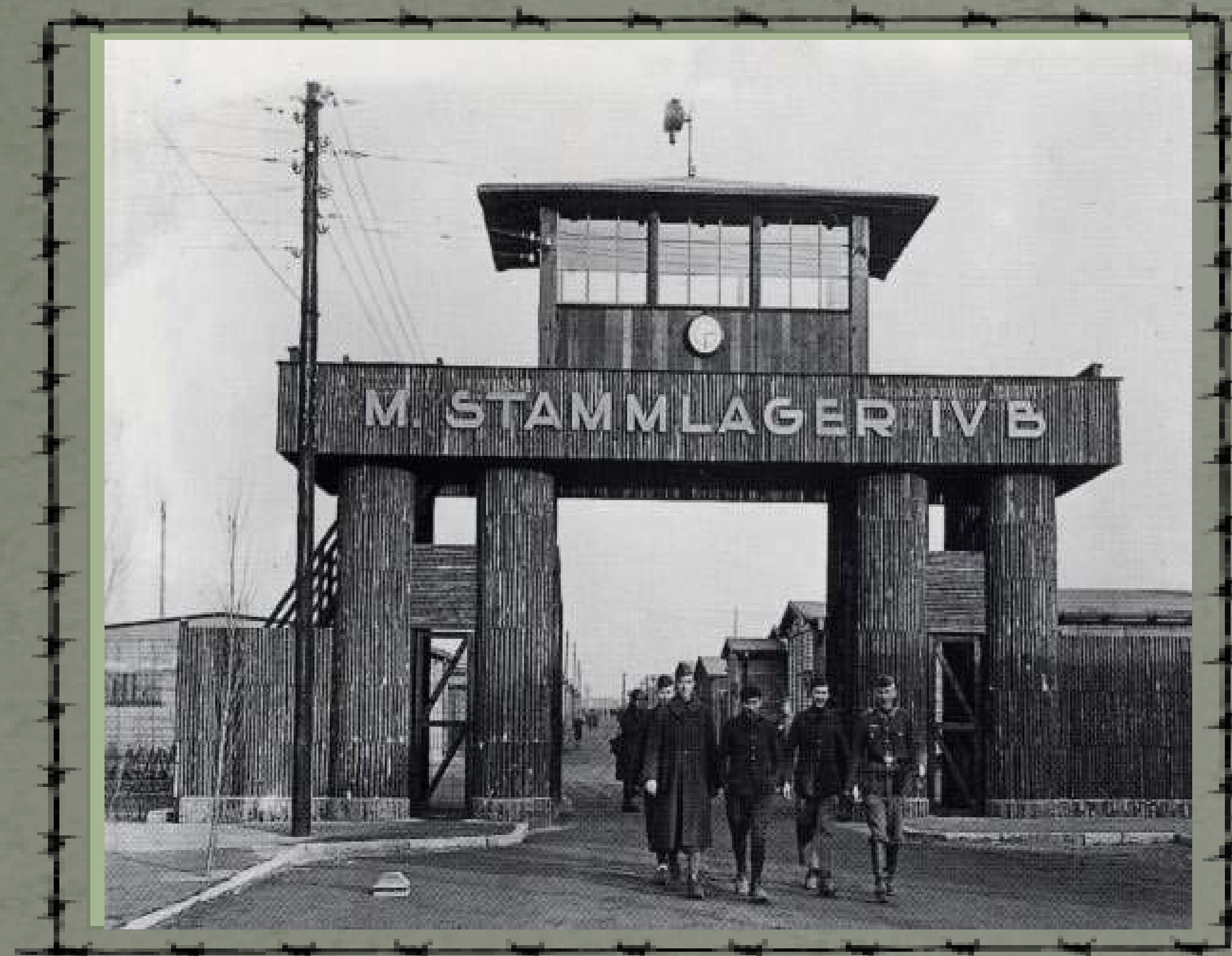
Entrance to Muhlberg's Stalag IV B, the largest German prison camp of the war.