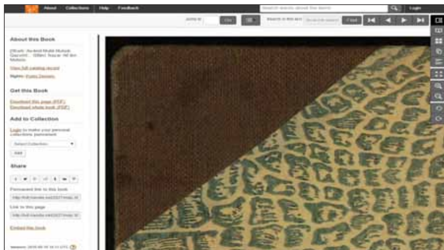
FIGURE 1. Viewing the cover of Isl. Ms. 1016 (Ann Arbor, University of Michigan, Special Collections Library), via the digital surrogate in the HathiTrust Digital Library.

opening of the text clearly appears, more than adequate for transcription, and thereby for analysis to identify the text. A characterization of the hand is also possible. A seal impression is also visible on the incipit page and zooming in reveals the numerals of a date in the seal. The writing surface again appears to be wove paper as suggested by the texture and appearance of the zoomed image. Continuing on, the presence of catchwords, page numbers penciled in Western numerals, the number of lines per page, the absence thus far of any rubricated keywords or headings, and the persistence of the same hand are all evident. Skipping all the way to the last image of the lower cover reveals the edges of a label on the spine. The sequence number of this image suggests something of the extent. Continuing in reverse order reveals a blank but once folded scrap of paper that has been paginated and scanned, as well as several blank leaves at the close of the codex following the close of the text and brief colophon. This colophon provides the copyist's name but no date of transcription. The seal impression and its date allow for only a very rough terminus ante quem (since the seal could have been used long after its production) and the unfortunate positioning of the seal's ground decoration makes two date readings likely (though one perhaps more likely).