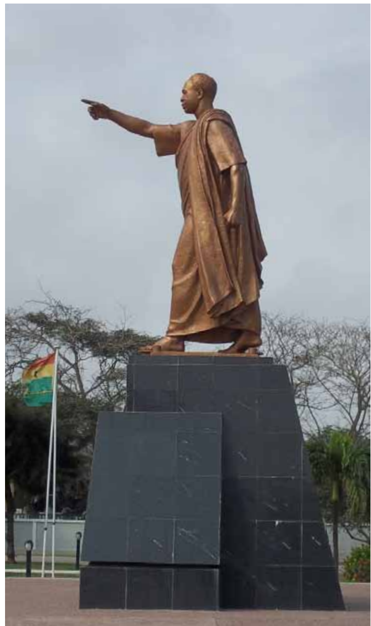
Statue of Kwame Nkrumah, Accra, Ghana