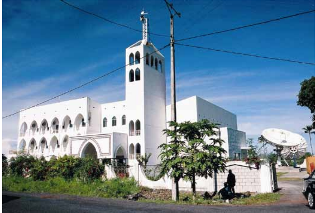
National TV and Radio Station, Moroni, Comoros (built with support from the Chinese government)