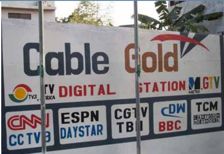
Cable Gold Television, Accra, Ghana (Started by a Chinese entrepreneur)