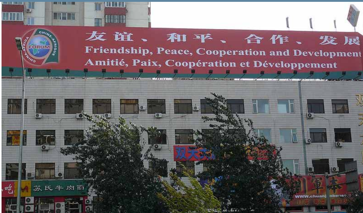
Forum on China Africa Cooperation, Beijing, China