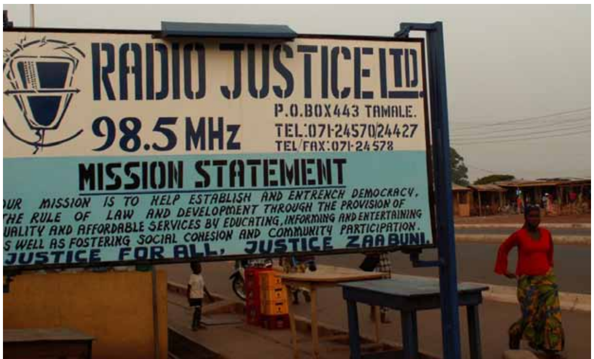
Radio Justice, Tamale, Ghana