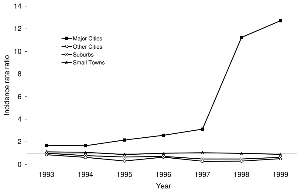
Figure 2 Annual gun homicide rates as a function of the prevalence of federal firearms licensees (FFLs) in U.S. counties, by county type, 1993–1999.

not far from the gun dealer where they were first obtained. Approximately 62 percent of crime guns traced by the ATF were first purchased from FFLs in the state where they were recovered by police, one-quarter (25.9%) of crime guns were recovered in the county where they were purchased, and 10.5 percent were recovered in a county adjacent to the county of purchase, almost all of which were in the same state (9.5%).[6] Moreover, almost one-third (32.2%) of traced crime guns are recovered by police within 10 miles of the FFL where they were first purchased, and over one-third (34.3%) are recovered between 11 and 250 miles of the FFL where they were first purchased.[6,8] Thus, an FFL appears most likely to have an effect in the home or surrounding counties.