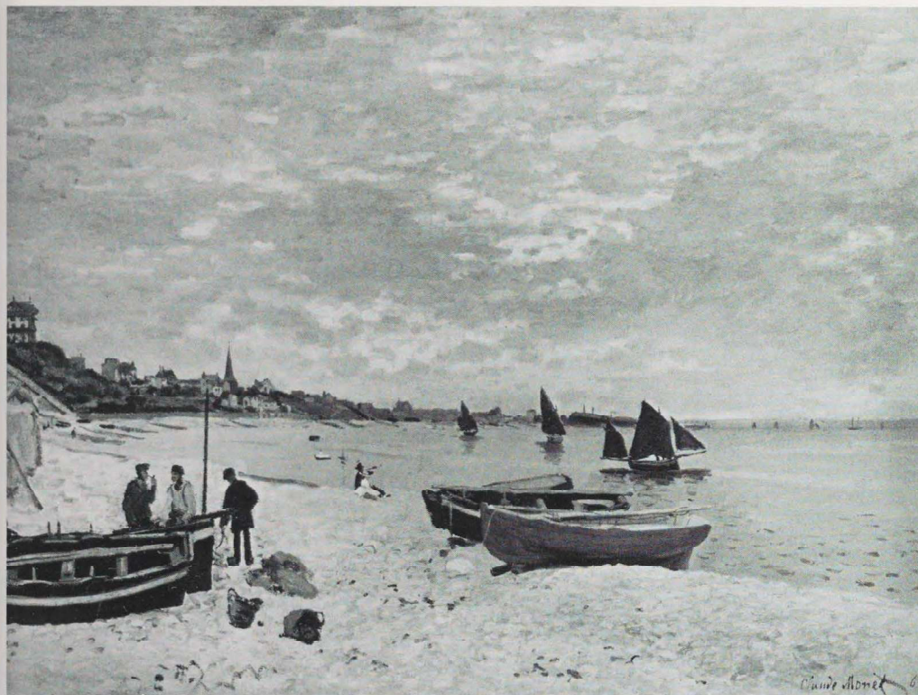
Figure 7 Claude Monet. The Beach at Sainte-Adresse , 1867. The Art Institute of Chicago. Mr. and Mrs. Lewis L. Coburn Memorial Collection.

broad areas of color to another, however, the radical nature of Monet's technique becomes evident, for no spatial progression, no systematic variation in illumination, is suggested. These areas do not lead to a central subject nor do they set one another off in a rational sequence — all seem capable of competing for attention as if, as I have stated, one were viewing either a fragmented image or an unusually integrated one. In the case of a fragmented image, the abrupt juxtaposition of brilliant hues would suggest a "naïve" vision recording in a simplified manner only the colors nature seems to provide; this is the technique often associated with the Japanese who (it was said) had never mastered "European" chiaroscuro (Duret 1885b:98–99). In the case of an integrated image, the uniformity of the illumination would suggest, in effect, that Monet employed no technique, for he imposed no devices of differentiation upon his vision. The Beach at Sainte-Adresse might then serve to signify only "what the artist sees," a "copying" of nature. At the same time, such an image would serve to convey what Monet, in his words, "personally deeply felt"; for what he may have learned from others can, supposedly, be nowhere in evidence in such an ignorant style. 8