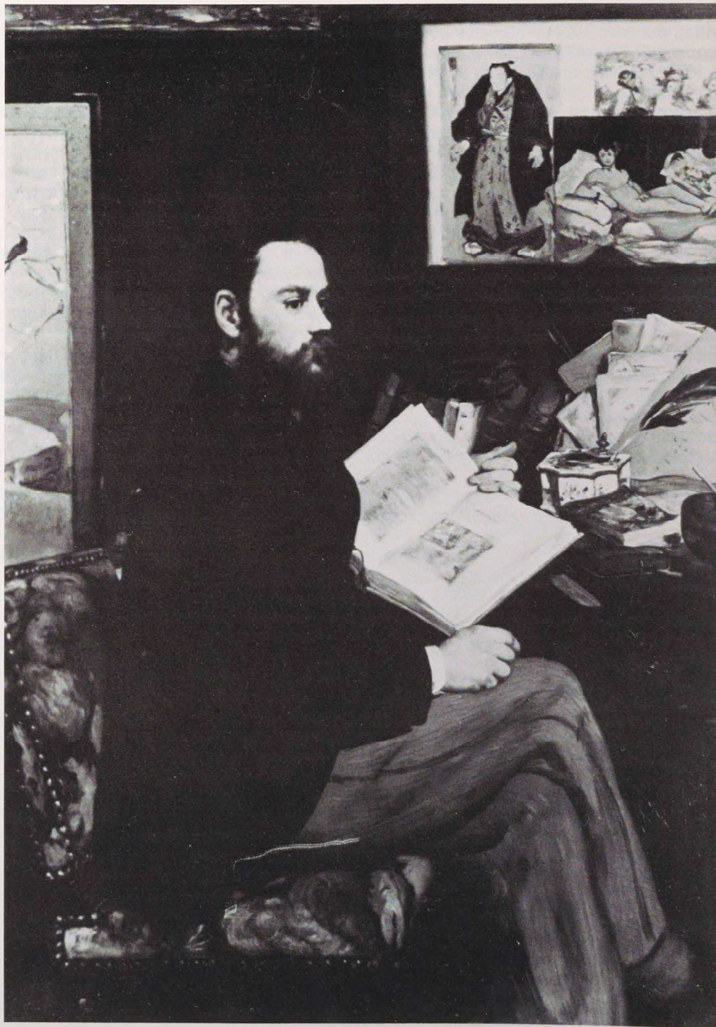
Figure 1 Édouard Manet. Portrait of Zola , 1868. Louvre, Paris.