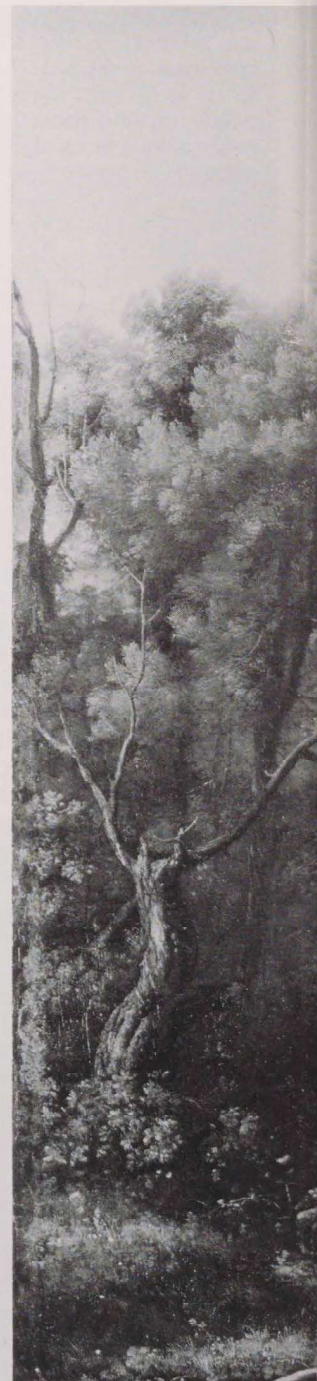
Figure 2 Claude Lorrain. The Ford , 1636. The Metropolitan Museum of Art, Fletcher Fund (1928).

Fromentin's comments appeared in the context of a historical study of the Dutch and Flemish masters of past ages; had he focused instead on the French, Claude would have been his paradigm in the area of landscape art: "we have had in France only one landscapist, Claude Lorrain" (ibid.:271). For Thomas Couture, too, Claude served as a model of excellence: "[his painting] escapes the analysis of its procedure; its technique is so perfect that [any sign of] the worker disappears completely" (Couture 1869:63). Couture seems to claim that Claude had achieved the