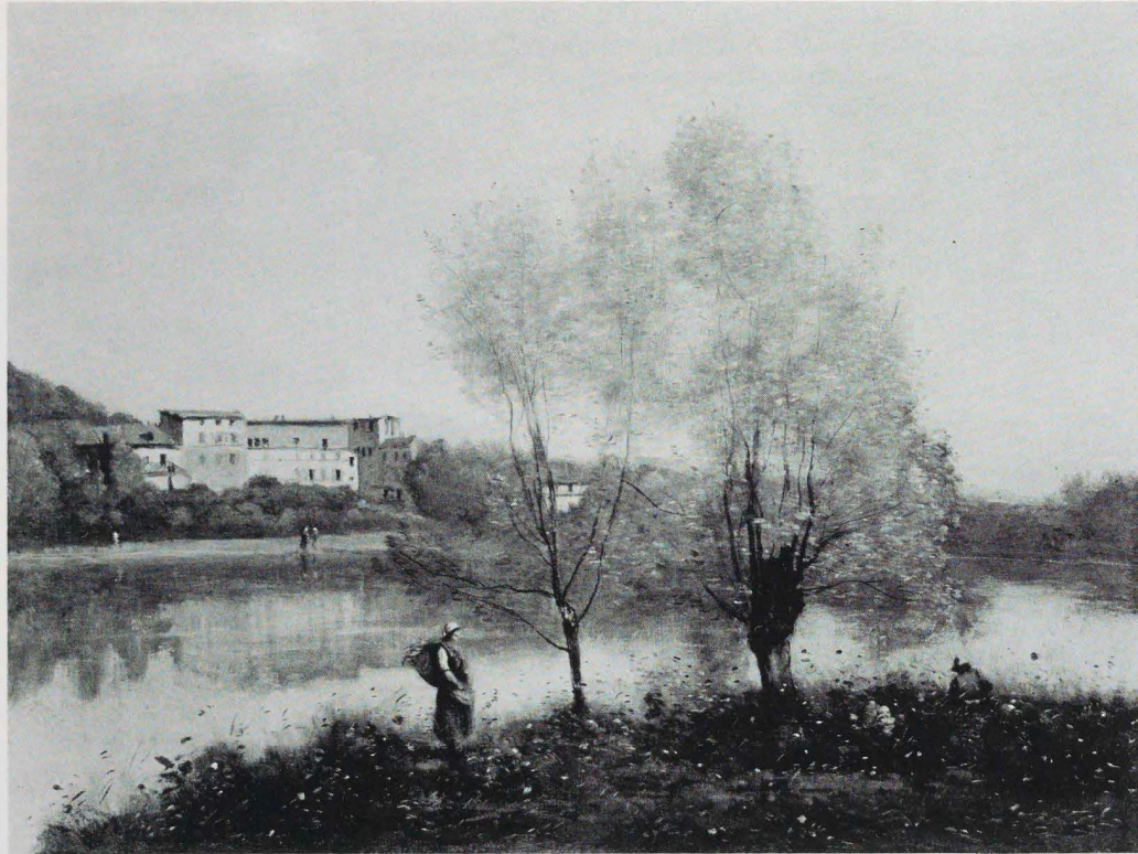
Figure 4 Jean-Baptiste-Camille Corot. Ville d'Avray , ca. 1867–1870. National Gallery of Art, Washington, D.C. Gift of Count Cecil Pecci-Blunt (1955).

the right of the central river, a second mass of foliage is differentiated by the presence of both a decaying tree and healthy ones.