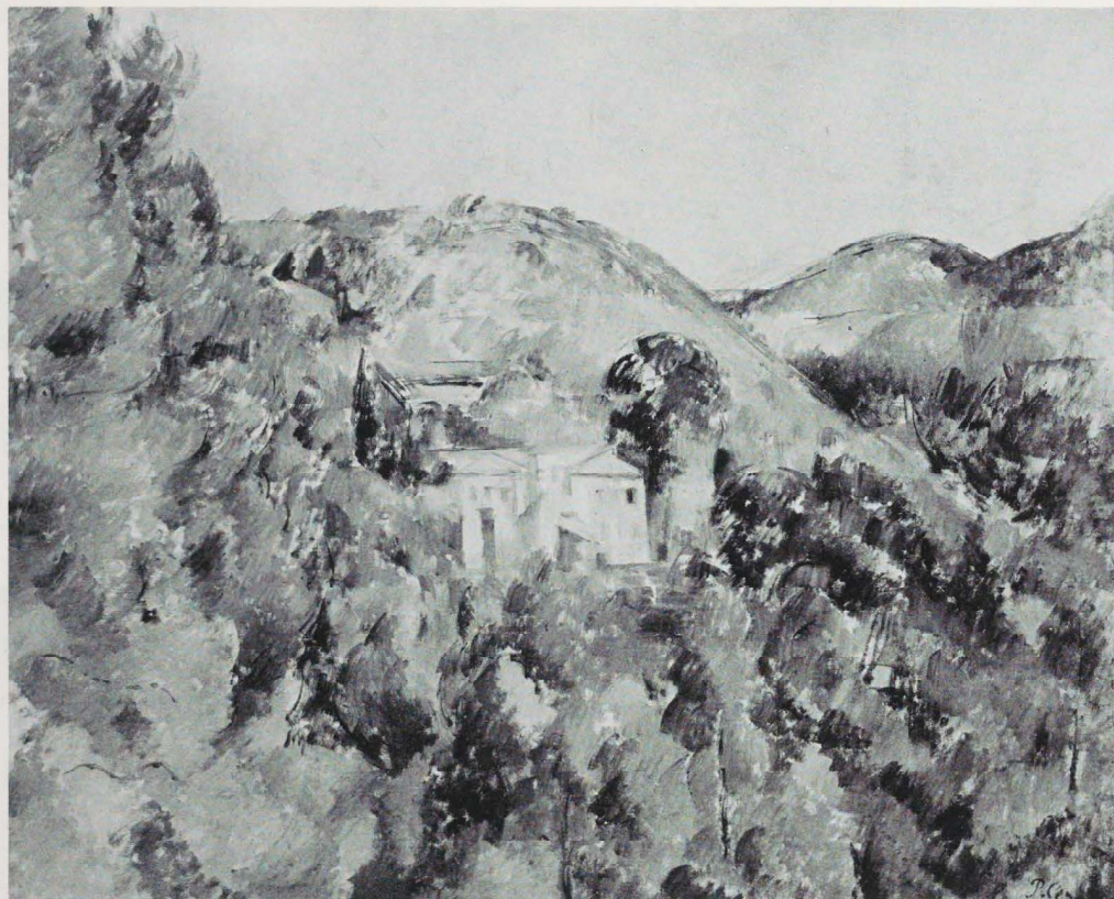
Figure 15 Paul Cézanne. View of the Domaine Saint-Joseph (la Colline des Pauvres) , ca. 1888–1898. The Metropolitan Museum of Art, New York. Wolfe Fund (1913). Catherine Lorillard Wolfe Collection.

and red-violets, and in the upper part of the canvas, he added red-orange, ochre, and violet to the blues and greens of the sky and foliage. The red-orange of the tree trunks distributes still more warm color throughout this area of the image, so that the cooler colors do not become decidedly dominant. Reciprocally, the linear integrity of these warmly colored trunks and branches becomes attenuated by additions of contrasting cool color painted over the base of warm tones. In general, the sense of an equal distribution of warm and cool colors is preserved in nearly every area of Pines and Rocks . Like the Domaine Saint-Joseph and so many other works by Cézanne, it lacks the clearly established spatial hierarchy conventionally determined by extended passages from dark to light or warm to cool.