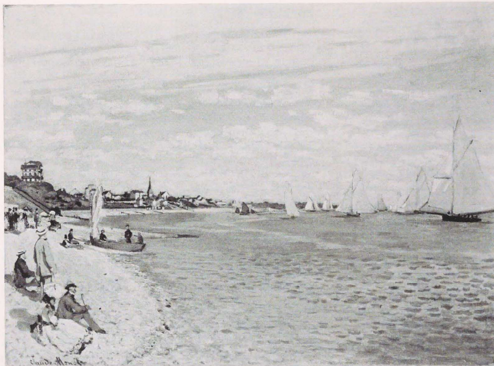
Figure 6 Claude Monet. The Beach at Sainte-Adresse , 1867. The Metropolitan Museum of Art, New York. Bequest of William Church Osborn (1951).

color but from the nature of the motif itself, a shoreline receding to a distant horizon. The artist does not "use" perspective; instead of building a volumetric space, he appears to "copy" what is inherent in the natural site.