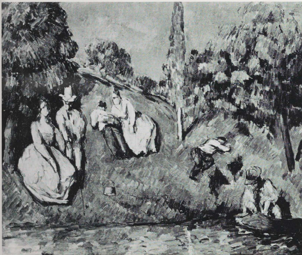
Figure 10 Paul Cézanne. The Pond , late 1870s. Museum of Fine Arts, Boston. Tompkins Collection, Arthur Gordon Tompkins Residuary Fund.