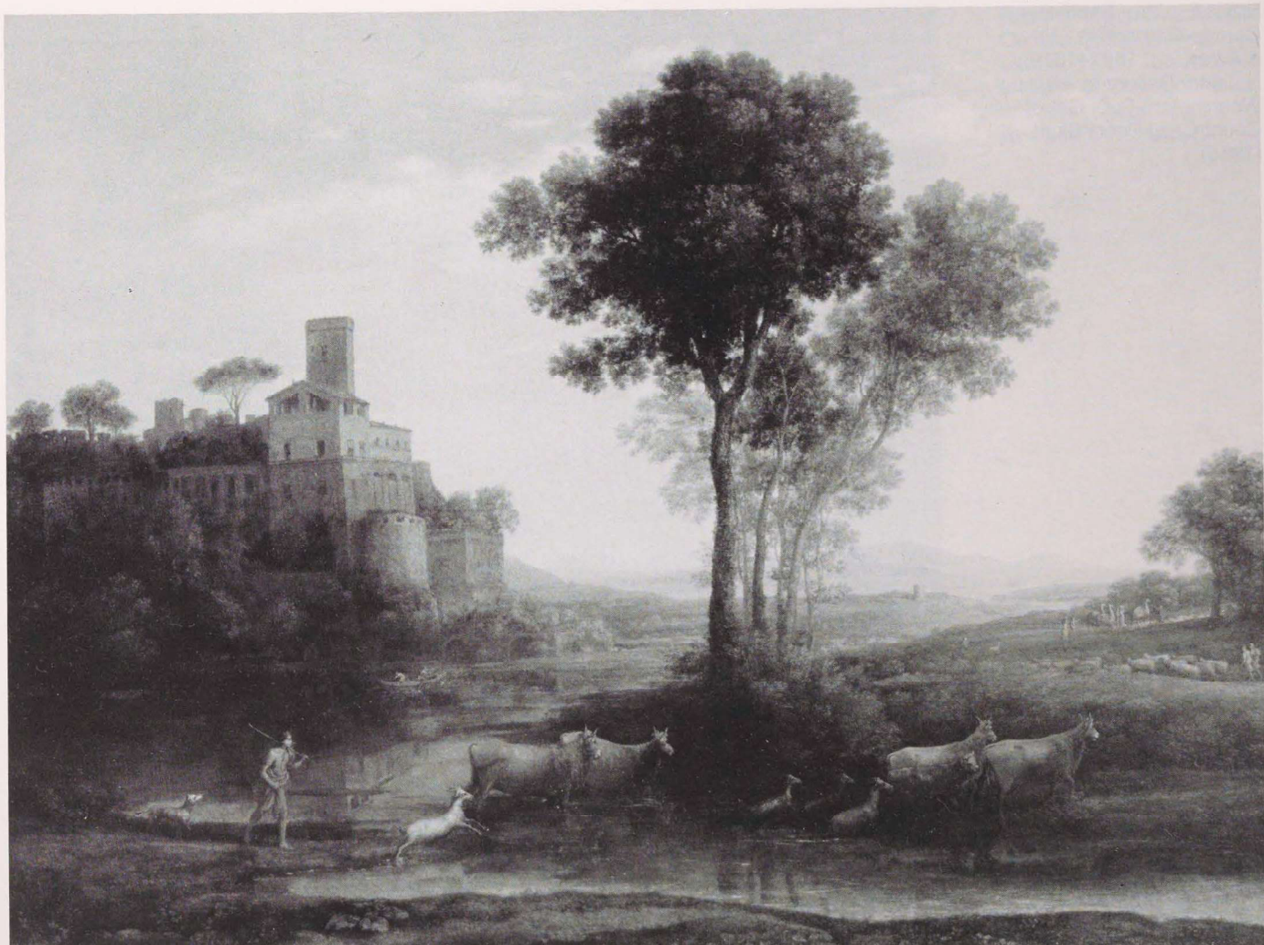
Figure 5 Claude Lorrain. Landscape with the Voyage of Jacob , 1677. Sterling and Francine Clark Art Institute, Williamstown, Mass.