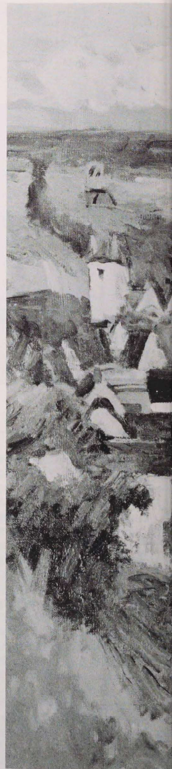
Figure 8 Paul Cézanne. Auvers: Village Panorama , ca. 1874. The Art Institute of Chicago. Mr. and Mrs. Lewis Larned Coburn Memorial (1933).

Cézanne's Auvers: Village Panorama , also called View of Auvers (Figure 8), dated c. 1874, reveals one of the artist's typical palettes and a manner of execution common in this period of his career. 10 As a panoramic view of a town, this painting may bear comparison with Corot's View of Genoa : both seem to set architectural features against a surrounding landscape and a distant vista. In Auvers , Cézanne suggests distance through the progressive diminution of the architectural forms and the relatively loose, broad execution of the background hills and sky. In addition, he uses a somewhat duller coloring in the background areas. Yet, View of Auvers embodies no clear compositional pattern or differentiation, for its hues, values, and textures are distributed evenly enough to create a sense of uniform illumination, a light that encompasses but does not determine or define. Bright primary hues — red, blue, yellow, brilliant green — range across the picture along with accents of white. 11 Unlike Corot's Genoa , Cézanne's Auvers gives little sense of framing an architectural subject by a contrasting expanse of foliage, nor does it center one element among others of decidedly different visual character. The village itself, like the general illumination, seems expansive and diffused. Some sense of a differentiating diagonal recession arises from the row of houses in the right foreground and seems reinforced by the placement of a mass of architectural