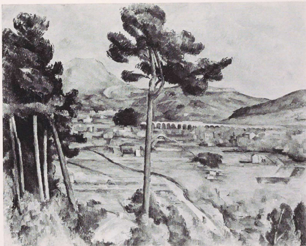
Figure 14 Paul Cézanne. Mont Sainte-Victoire , ca. 1885. The Metropolitan Museum of Art, New York. Bequest of Mrs. H. O. Havemeyer (1929). The H. O. Havemeyer Collection.

displays a regular pattern of blue and blue-green, with some touches of blue tending toward blue-violet. In this painting, Cézanne confined the remaining compositional area, the sky, to minor variations of a single hue (blue-green), but in other paintings, especially later ones, he often created a scintillating pattern of juxtaposed hues even in nominally "clear blue" skies. For example, in his Mont Sainte-Victoire of c. 1885 (Metropolitan Museum) (Figure 14), tones of pale blue-green vibrate among pale blues to suggest a brilliant luminosity.