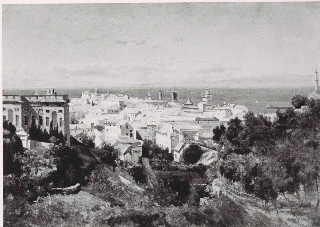
Figure 3 Jean-Baptiste-Camille Corot. View of Genoa , 1834. The Art Institute of Chicago. Mr. and Mrs. Martin A. Ryerson Collection.

technical mastery Manet would later seek, to render technique itself invisible. This genius freed himself from all academic practice; yet Claude became the model for academics. Succeeding generations emulated his refined manner because his well-differentiated light and color corresponded with the academic ideal of a technique subtly responsive to specific expressive aims. While perhaps attaining magical effects, Claude's technique was yet subject to academic analysis of the simplest sort, for his compositions quite obviously depended on the interrelationships of their well-defined parts. His light (and the space it created) exemplified what became a traditional academic principle; as Charles Blanc would say, such pictorial light was properly arranged and composed of its varying elements—"unified, but not uniform" (1880:555).