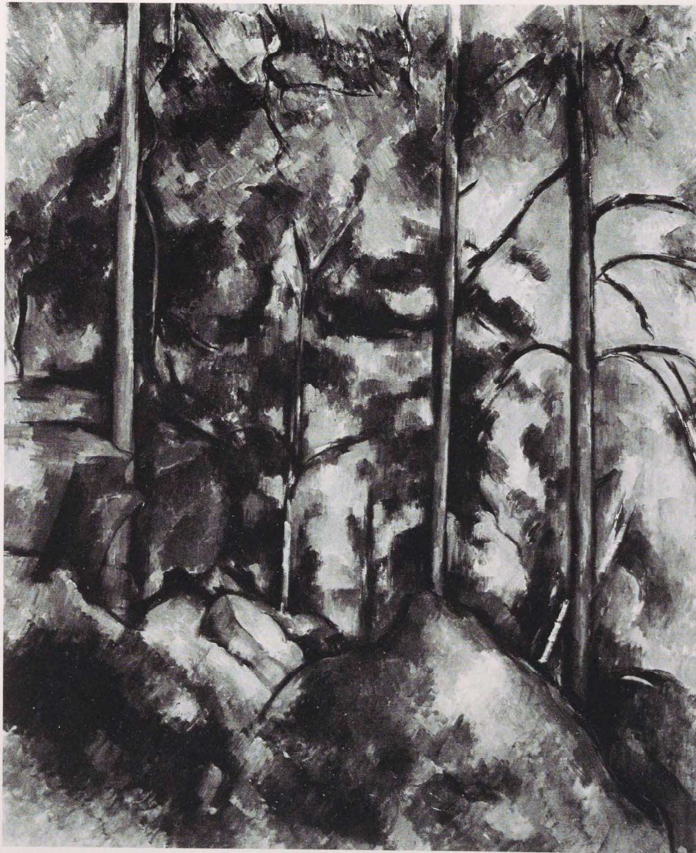
Figure 16 Paul Cézanne. Pines and Rocks ( Fontainebleau? ), ca. 1896–1900. Collection, The Museum of Modern Art, New York. Lillie P. Bliss Collection.