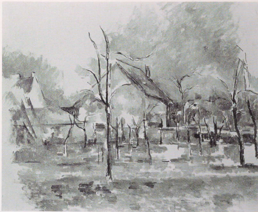
Figure 11 Paul Cézanne. Paysage d'hiver , late 1880s. Philadelphia Museum of Art. Given by Frank and Alice Osborn.

forms in the left middle-ground, but this configuration appears simply as evidence of the artist's direct observation. Cézanne's viewers would not see it as a preconceived pictorial device, the application of a law of perspective, because there is no corresponding variation in illumination (i.e., chiaroscuro modeling). Similarly, the rising slope of land at the left foreground does not serve as a conventional repoussoir device, for it, too, is relatively undifferentiated in terms of value, and its green coloration readily agrees with that of the central area which it might otherwise set off.