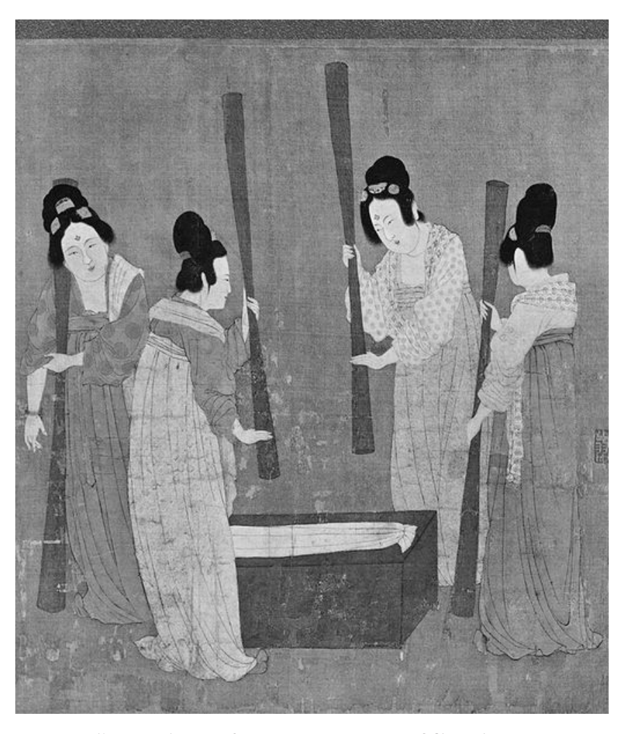
Attrib. to Huizong of Song, Women Prepaing Silk, 12th century. Indian ink and color on silk. Museum of Fine Arts, Boston.