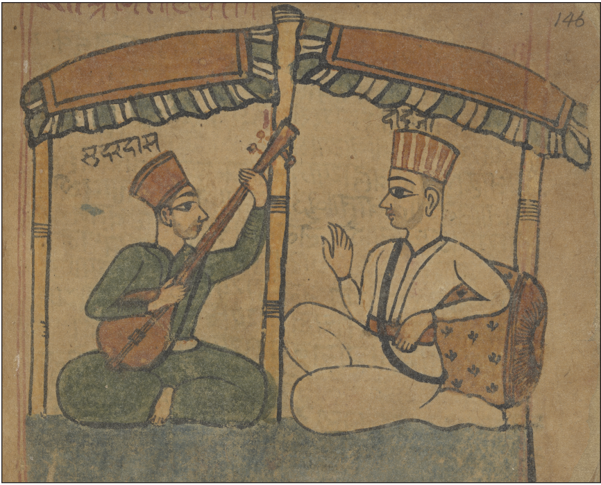
FIGURE 4. Sundardās and Dādū in conversation. Wellcome Collection, MS Hindi 371, fol. 146r.

(fol. 146r; fig. 4), fits well with the abbot's preoccupations at the time. 43 It is not unlikely that Sundardās's compositions became part of the Dādūpanthī lithurgy at exactly this time. 44 The Jayat-prakāś articulates the obligation for Dādūpanthīs to collect the words of the Sants and carry those with them, which constitutes an immediate imperative for the writing of manuscripts, such as this one. 45