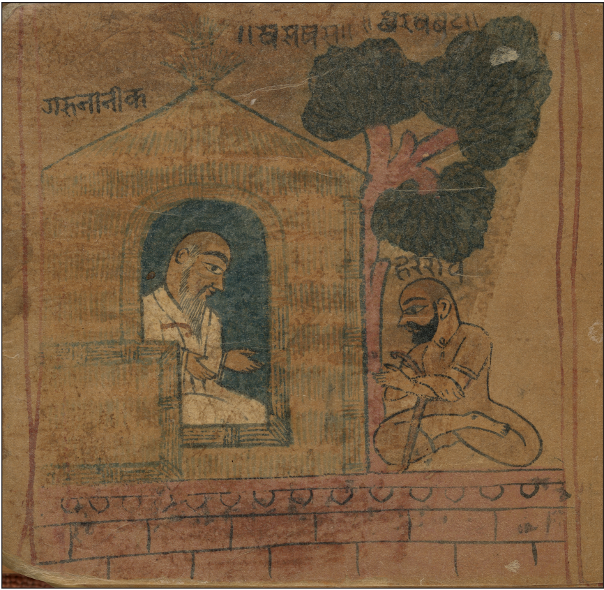
FIGURE 5. Guru Nānak and Harirāy in conversation. Wellcome Collection, MS Hindi 371, fol. 188v.