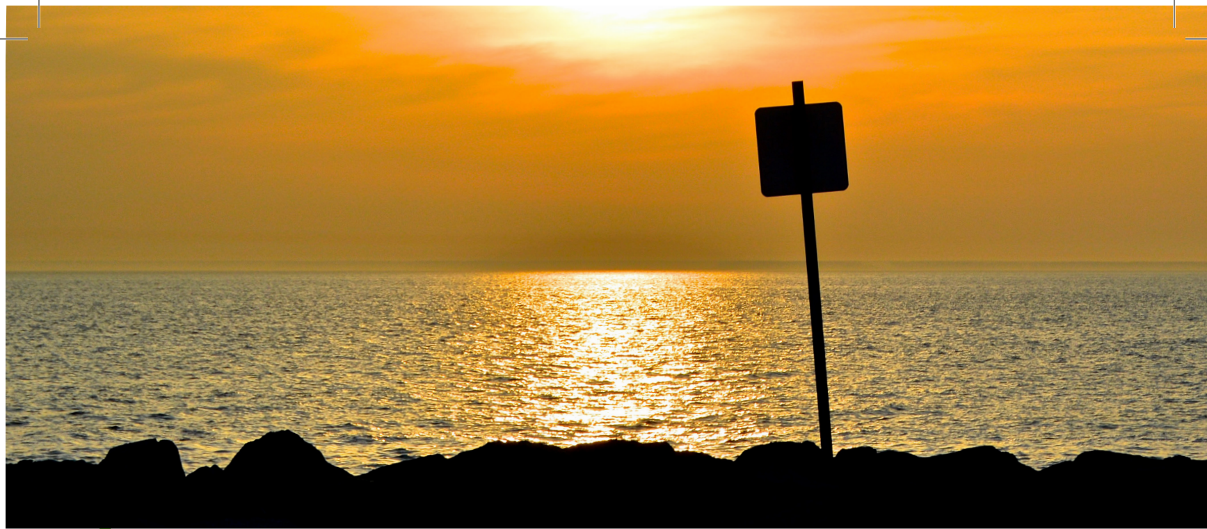
A man on the Western Seawall at sunset

“ Any successful action plan must be built on a foundation of trust, mutual interests, and understanding between all stakeholders. ”