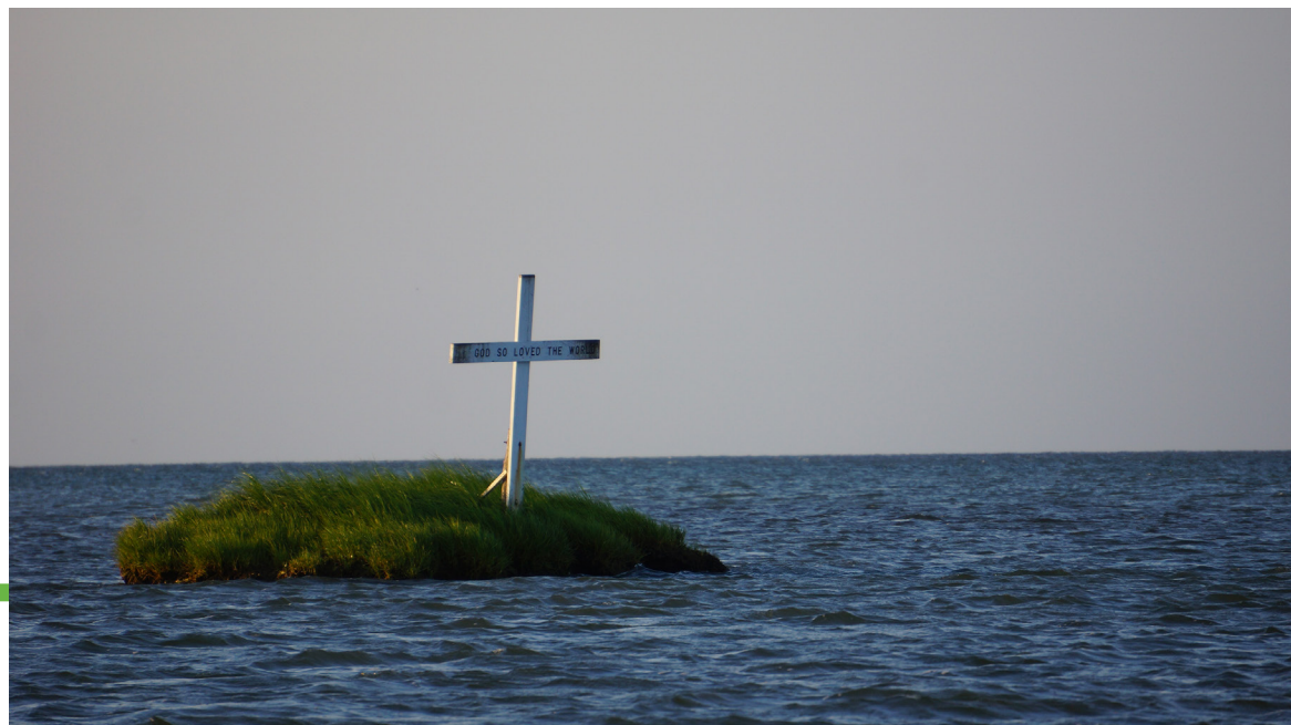
A cross reads, "For God so loved the world." The patch of marsh grass was once part of the main island.

A lack of exposure to flooding explains the disconnect between scientific knowledge and individual residents' perceptions of flooding as a real threat.