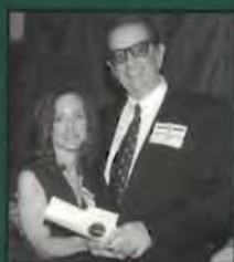
Alumni Day '96 (page 14)