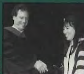
Commencement (page 10)