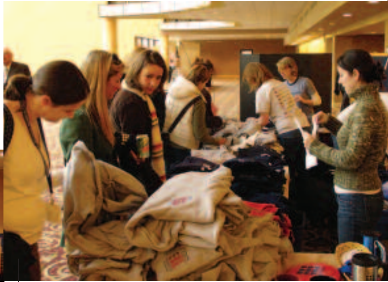
SCAVMA offered Penn Vet wares to conference attendees.

Penn Vet hosted its 107th Penn Annual Conference on March 1 and 2, 2007, at the Sheraton City Center Hotel in Philadelphia, welcoming more than 1,200