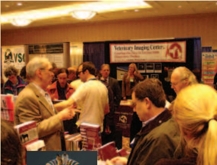
More than 90 exhibitors participated in the 107th Penn Annual Conference.

For the first time ever, Penn Vet partnered with the Pennsylvania Veterinary Medical Association, who hosted a pre-conference session that addressed risk management, as well as a dinner with presentations on animals in ancient Egypt, followed by exclusive entrance to the Tutankhamun and the Golden Age of Pharaohs Exhibit at the Franklin Institute.