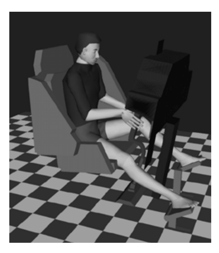
Figure 2. Smooth body Jack as virtual occupant in an Apache helicopter CAD model.