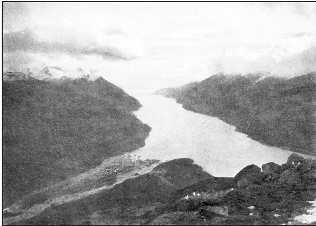
The Lynn Canal and the Skagway River.

Secretary of State John Hay sent a drafted proposal for the tribunal to Julian Pauncefote, envoy extraordinary and