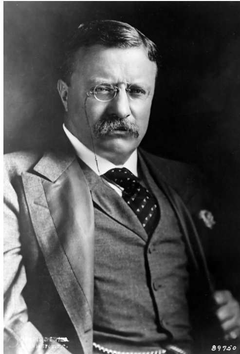
Theodore Roosevelt in his presidential years.

Roosevelt was playing fast and loose, and the British saw that he would risk severely harming the budding relationship between England and America for the sake of a small strip of land in a barely inhabitable area bearing trace amounts of gold. Fortunately for the sake of smooth Anglo-American relations at this critical stage, Hay and the British statesmen kept cool heads and paved the way for London and Washington to get