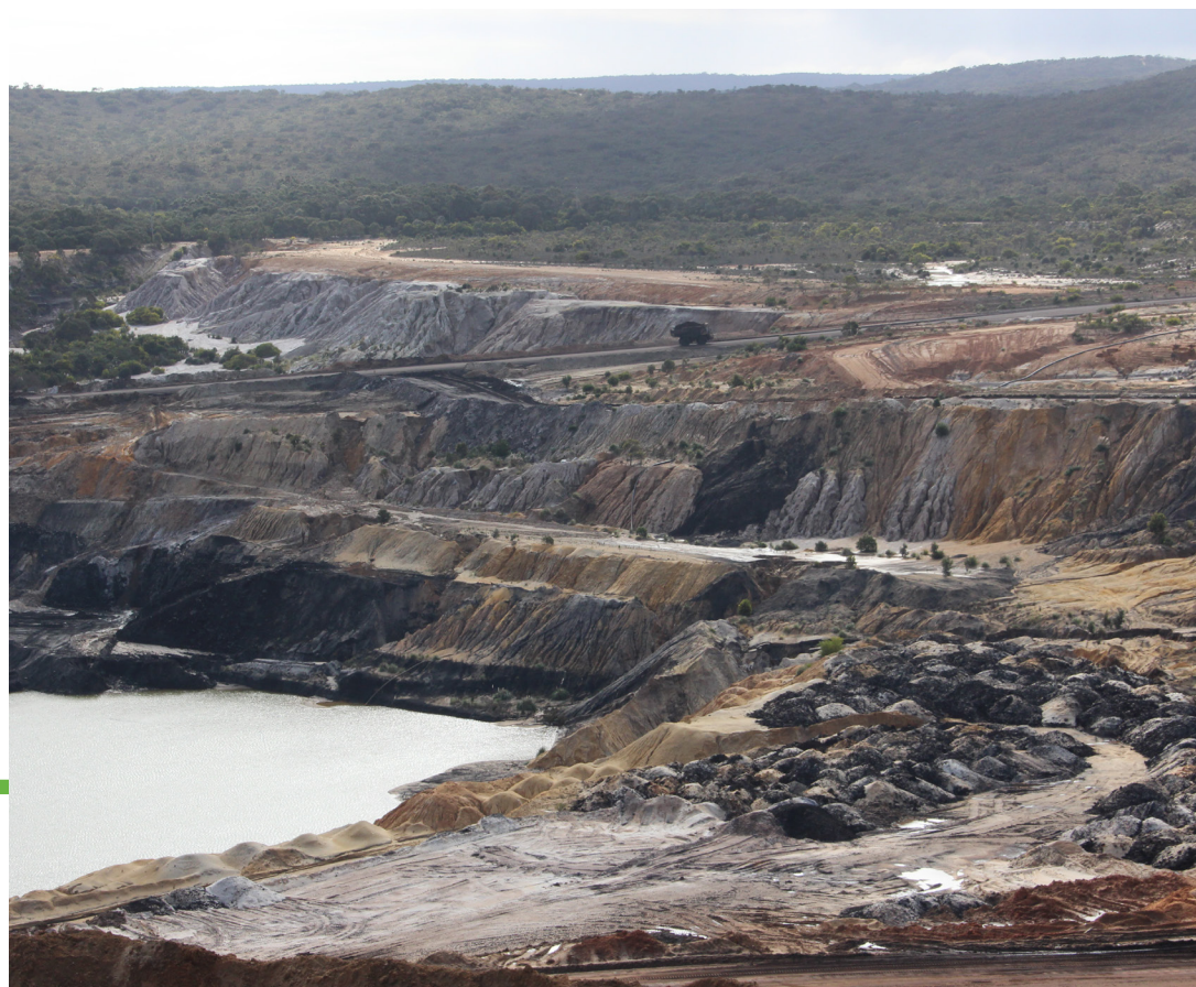
The ALCOA Anglesea open-cut coal mine extracts exclusively brown coal, which is used to generate energy at the nearby power station.

Australia sits upon a throne of coal. The nation's brown and black coal industries bring immense wealth through the exportation and industrial uses of coal, as well as the jobs it creates. Although Australia benefits from coal economically, it is also hurt by it environmentally. Coal combustion, extraction, and transportation have far-reaching impacts. For example, these processes result in pollution, greenhouse gas emissions, and reduction of biodiversity through coral bleaching. Despite outcry from the public, the Australian Liberal National Party under Tony Abbott's administration does little to mitigate these industrial harms, as they fear economic ruin if the country chooses to divest from coal. Economic ruin, however, is avoidable, as long as Abbott's administration seeks alternative options to coal, such as solar energy and liquefied natural gas.