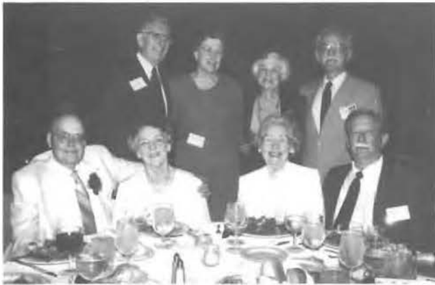
Class of 1942