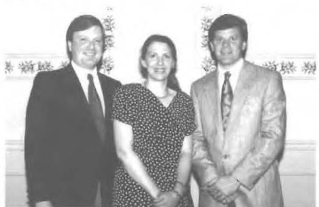
Class of 1982