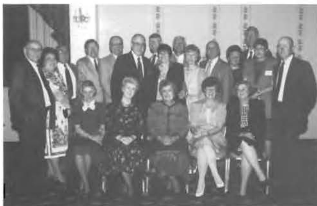
Class of 1952