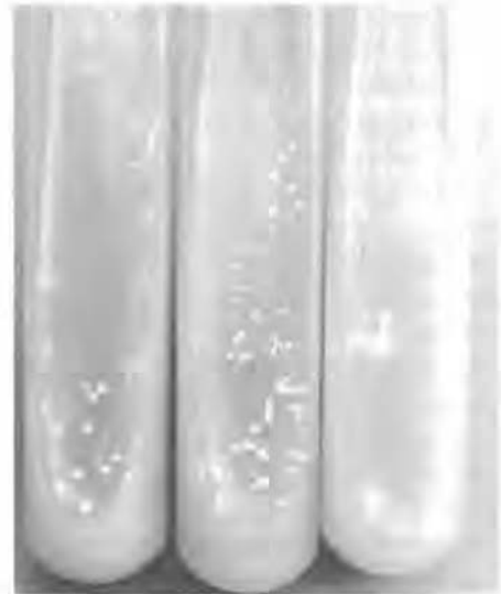
Herrold's egg yolk media with the typically appearing colonies for Mycobacterium paratuberculosis. The Johne's organism often requires 10-12 weeks to appear visible on the media surface.

Johne's disease is not only a threat to agriculture, it also affects other