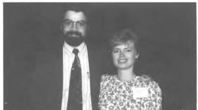
Class of 1987