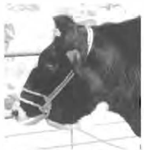
A cow with bottle jaw. Bottle jaw is a non-specific yet typical sign of advanced Johne's disease.

The initial test is an ELISA screening test. If an animal is positive, then a fecal culture is performed within 21 days. This test takes about 12