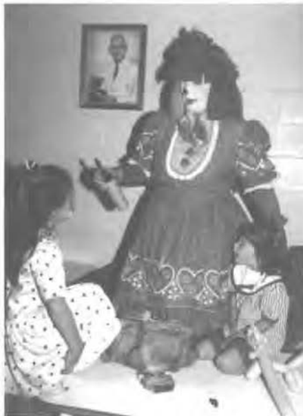
Alumni children are entertained by a clown at Alumni Day.