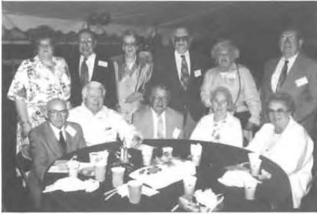
Class of 1937