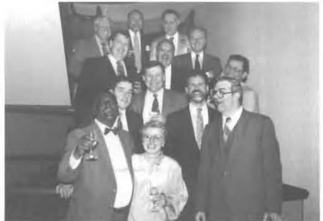
Class of 1967