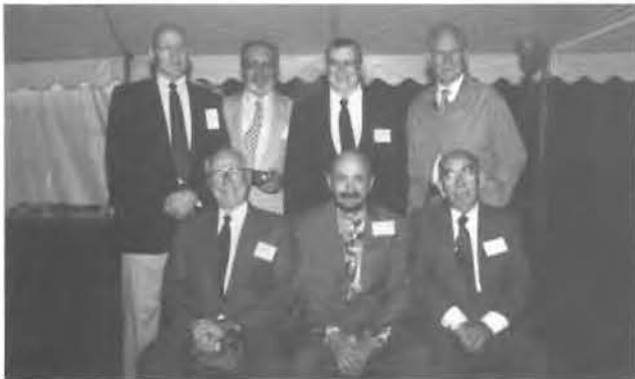
Class of 1947