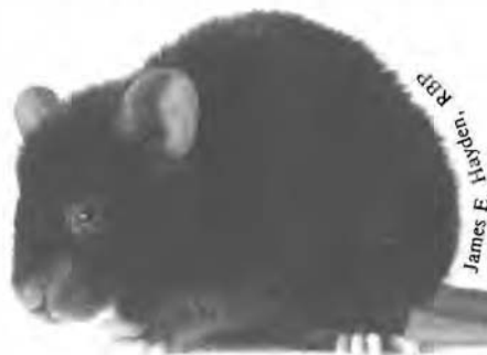
A mouse afflicted with MPS VII.

The work was supported by grants from the National Institute of Diabetes and Digestive and Kidney Diseases, the National Institute of Neurologic Disorders and Stroke, the National Institute of Allergy and Infectious Disease, the National Center for Research Resources, the Mrs. Cheever Porter Foundation, and the Lucille P. Markey Charitable Trust.