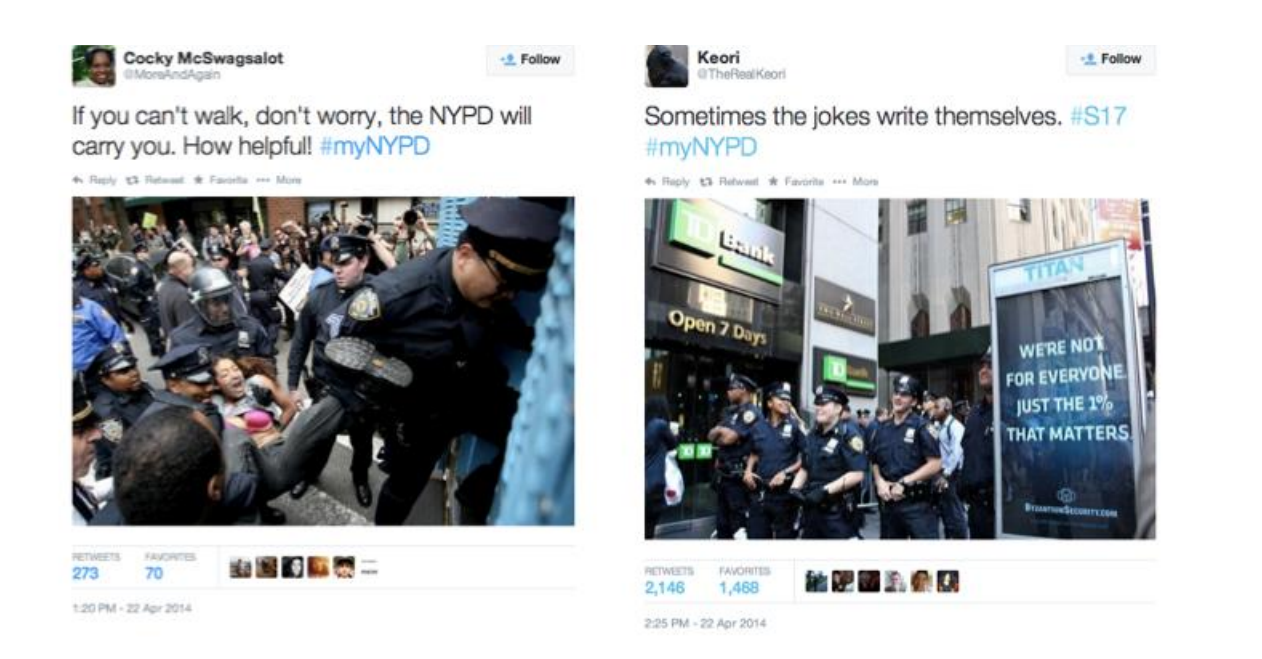
Figure 5. Examples of counterpublic tweets that use sarcasm (left) and snark (right) as discursive strategies.