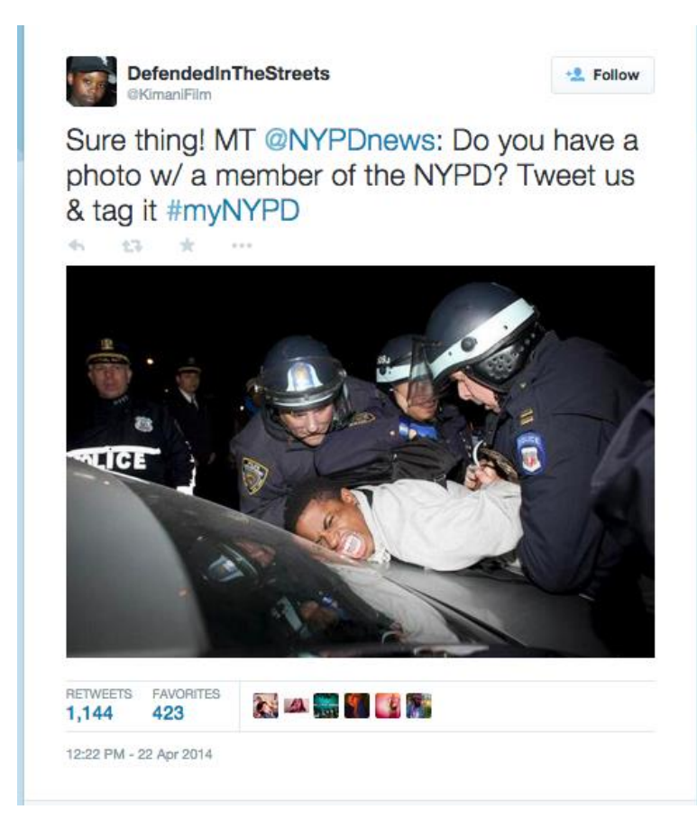
Figure 4 . Hijacked tweet by @KimaniFilm retweeting the NY Police Department's (@NYPDNews) request for photos with a counternarrative image.