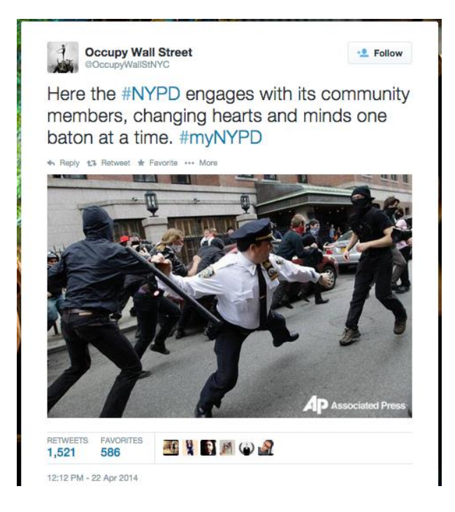
Figure 2. Example of a hijacked #myNYPD tweet, in this case Occupy Wall Street (@OccupyWallStNYC) using sarcasm to illustrate NYPD brutality.