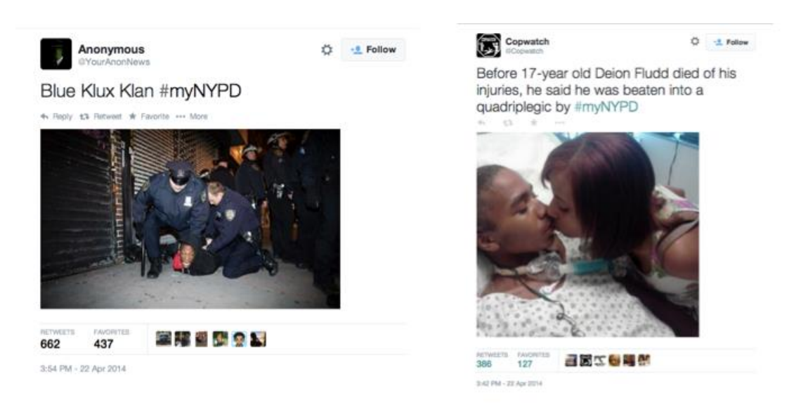
Figure 6. Examples of counterpublic tweets that use hyperbole (left) and outrage (right) as discursive strategies.

Figure 5. Examples of counterpublic tweets that use sarcasm (left) and snark (right) as discursive strategies.