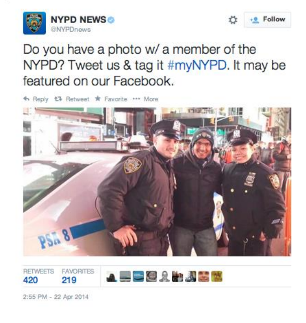
Figure 1 . The original #myNYPD tweet, issued by the New York City Police Department (@NYPDNews) on April 22, 2014.

Chris Rock. Chicago, IL: Lawrence Hill Books.