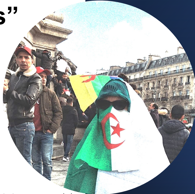
Photo from a protest against Islamophobia in France and the ban on full-face coverings in effect in the country since 2011 (2020)