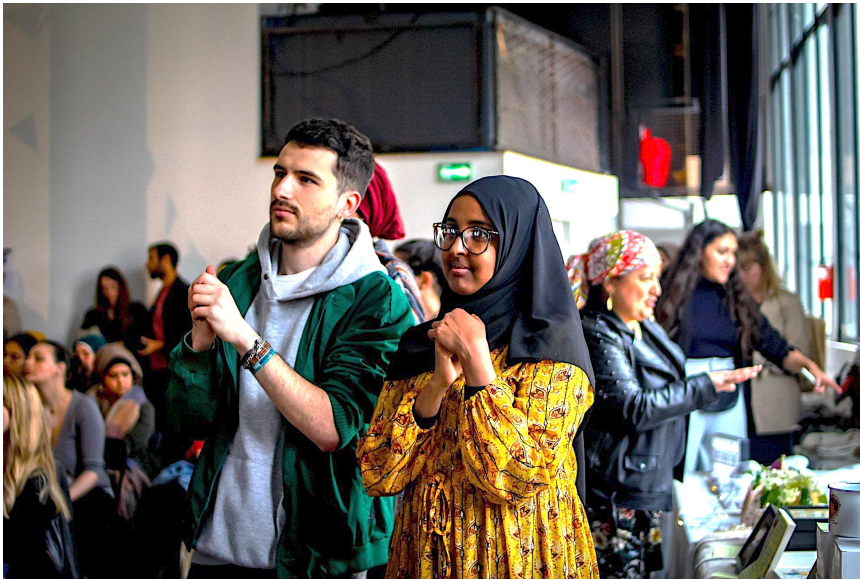
Photo of a youth activist gathering within Lallab, a feminist and anti-racist organization in Paris (2019)