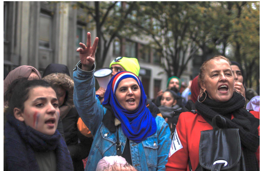
Photo from a protest against a legal proposal by deputies to ban women that wear the headscarf from school trips in France (2020)