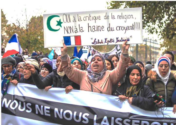
Photo from a protest against a legal proposal by deputies to ban women that wear the headscarf from school trips (2020)