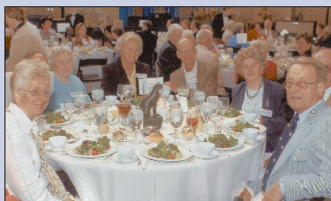
Members of the Class of 1957 in the Chinese Rotunda of the University of Pennsylvania Museum.