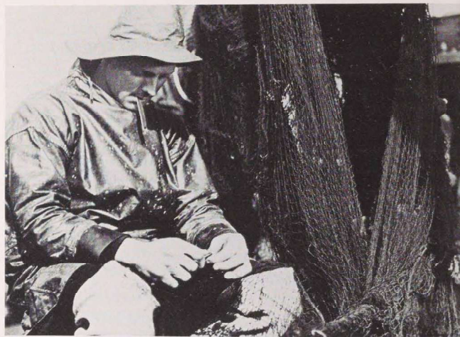
Figure 1 John Grierson, Drifters , 1929.

Grierson produced a special report on the use of films for empire trade propaganda and film publicity in general, which led to the creation of a separate Films Sub-Committee. In his report, Grierson criticized the idea of using "incidental publicity" in feature films to promote British and empire products. The principal objections he raised were the very limited distribution of British feature films and their traditionally "shabby"