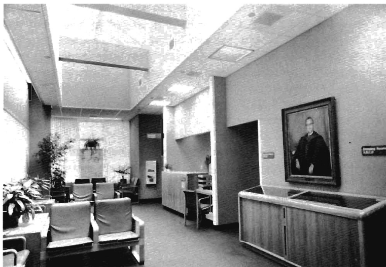
Reception area of the Eugene P. Pendergrass Outpatient Clinic at the Radiology Department