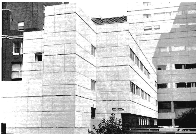
William H. Donner Center for Radiology