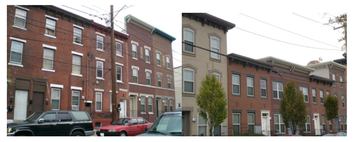
Figure 4: A typical Hawthorne street.