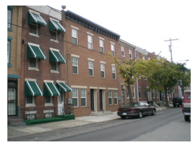
Figure 6: Block of Hawthorne with both MLK homes and existing homes.

Along with building on the site where the towers once stood, TGP built infill houses, renovating abandoned or blighted lots on nearby streets. I identified these TGP houses by making a visual survey and mapping the uses of the neighborhood (see Figure 1, Background Section). By building these infill houses, TGP truly wove their units into the fabric of Hawthorne. Visually, this acts as a litmus test for TGP, showing that their architectural style truly is aligned with the character of Hawthorne. Spatially, by scattering units TGP ensures that if the unit is affordable, that is, set below market price for those who qualify, the family won't be stigmatized based on location.