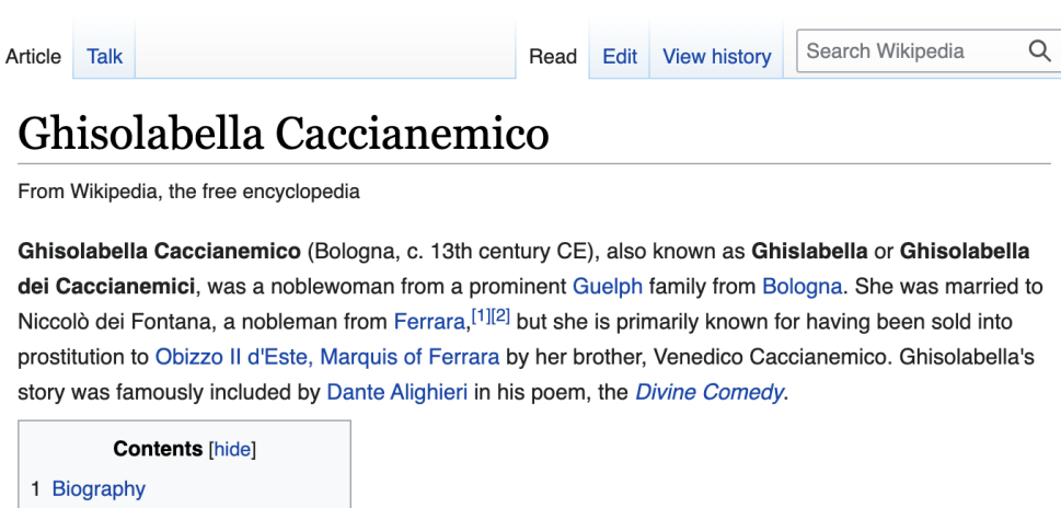
Contents [hide] 1 Biography 2 Role in Dante's Divine Comedy 2.1 Overview 2.2 Significance 3 Legacy 4 References