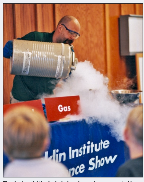
The day's activities included a science show presented by The Franklin Institute Science Museum.