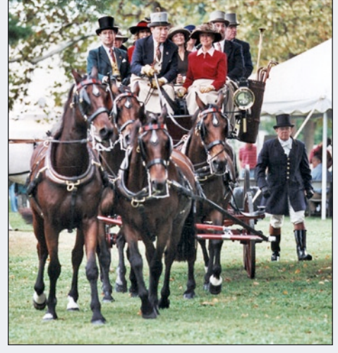
Participants in a carriage drive sponsored by An Evening in Old Philadelphia, a group that raises funds for New Bolton Center, stopped for lunch during the Alumni Picnic.