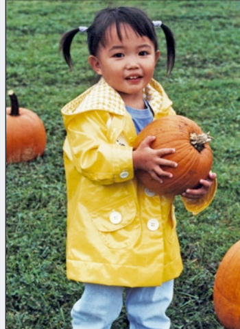
Hayrides were offered to the New Bolton Center pumpkin patch, where children picked their own pumpkins to take home.