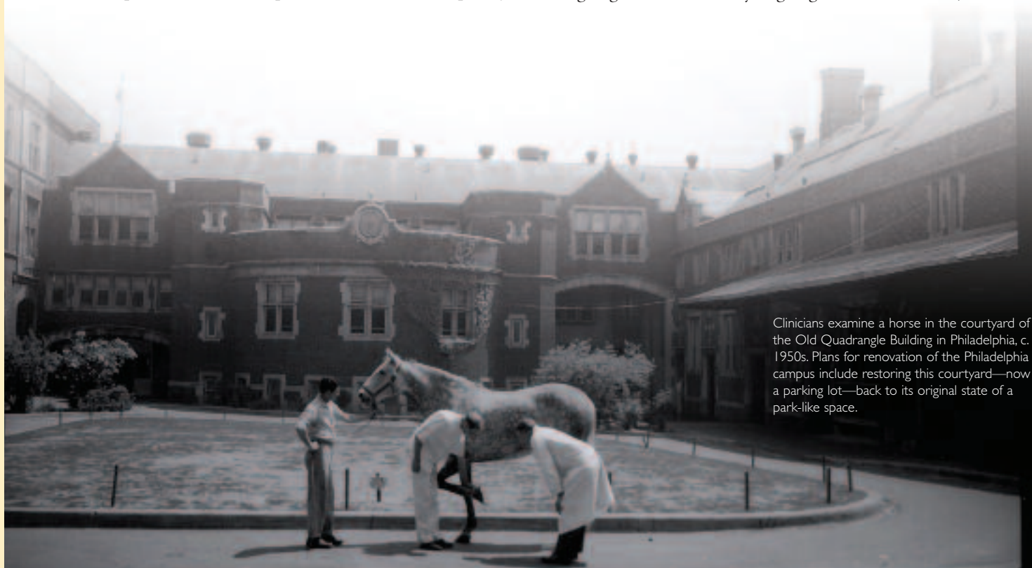
Clinicians examine a horse in the courtyard of the Old Quadrangle Building in Philadelphia, c. 1950s. Plans for renovation of the Philadelphia campus include restoring this courtyard—now a parking lot—back to its original state of a park-like space.