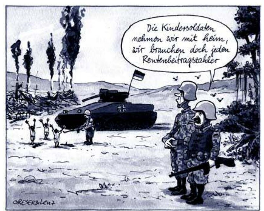
Wird der Kongo - Einsatz ein Erfolg?

"Let's take the child soldiers home - we need more kids to pay our pensions."