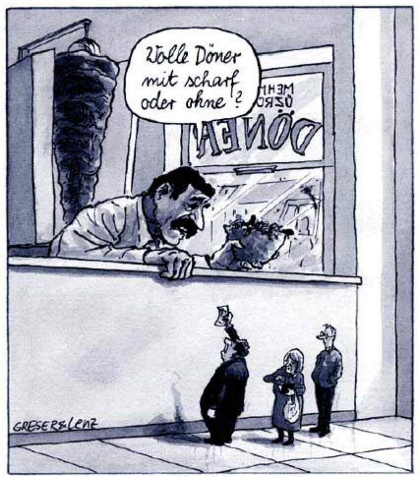
Die deutsche Bevölkenung schnumpft