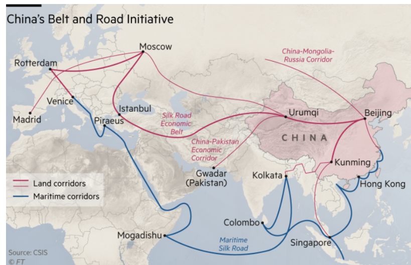
Figure 1: Land and sea-based routes of BRI

which would link China to the Baltic Sea, the Mediterranean Sea, and the Persian Gulf. 45 The Road portion includes two routes intended to connect the East China Sea to the Mediterranean Sea and to the South Pacific Ocean. 46