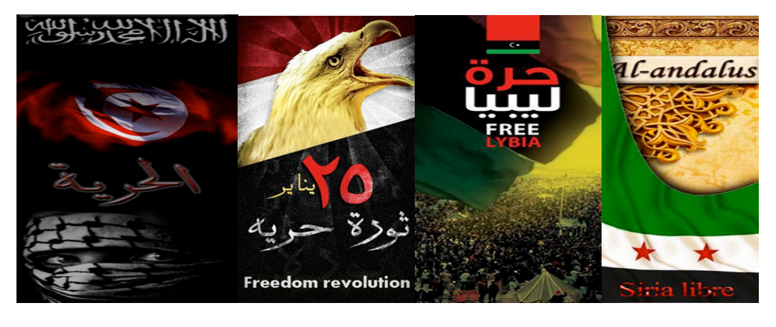
Fig. 5.5 Fig. 5.6 Fig. 5.7 Fig. 5.8

The image on the left shows the Tunisian flag and the face of a protestor covered with the Kufiyya (Arab headwear). At the top of the image, the Muslim shahadah (testimony) is written: "There is no god but God, Mohammad is the Messenger of God." Under the Tunisian flag, the word 'freedom' is inscribed. The image not only lends support for the Tunisian protests but frames it as an Islamic movement. The second image is in support of the Egyptian uprising. It shows the eagle in the Egyptian flag rising. The Arabic words read "25 January is a revolution for freedom." The third image shows the new Libyan flag of the uprising against a background that purportedly shows a protest in Libya. The Arabic reads: "free Libya." The fourth image shows the Syrian opposition's flag to the background of an Andalusian archeological structure and the Al-Andalus banner. The image connotes that the Syrian revolution is uncovering the history of Al-Andalus or is a direct continuation of the history of Al-Andalus. Clearly, it is a direct statement of support by Al-Andalus to the Syrian uprising.