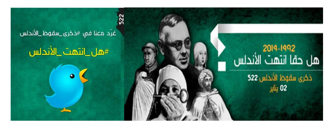
Fig. 5.3 Fig. 5.4

the past and the present. More accurately, it transports the historic past into the current political environment by asking the rhetorical question whether Al-Andalus "has ended." Clearly, Al-Andalus then is not only a historic past era, rather it is a usable cultural and political memory. For instance, both images below were shared on Facebook to encourage participation in the campaign in late December 2013/early January 2014.