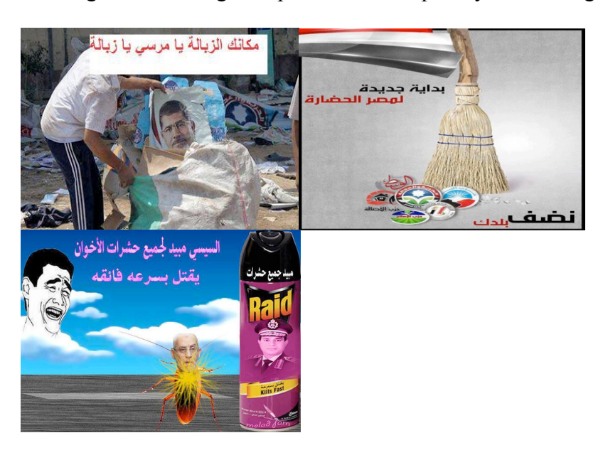
Fig. 2.5 Fig. 2.6 Fig. 2.7

The meme shows a man saying "dirty and polluted figures" placed above pictures of the Muslim Brotherhood leadership with the caption "to the garbage dump of history." Other memes that were shared on the Facebook and Twitter campaign focused solely on the cleaning and cleansing metaphor without explicitly mentioning history.