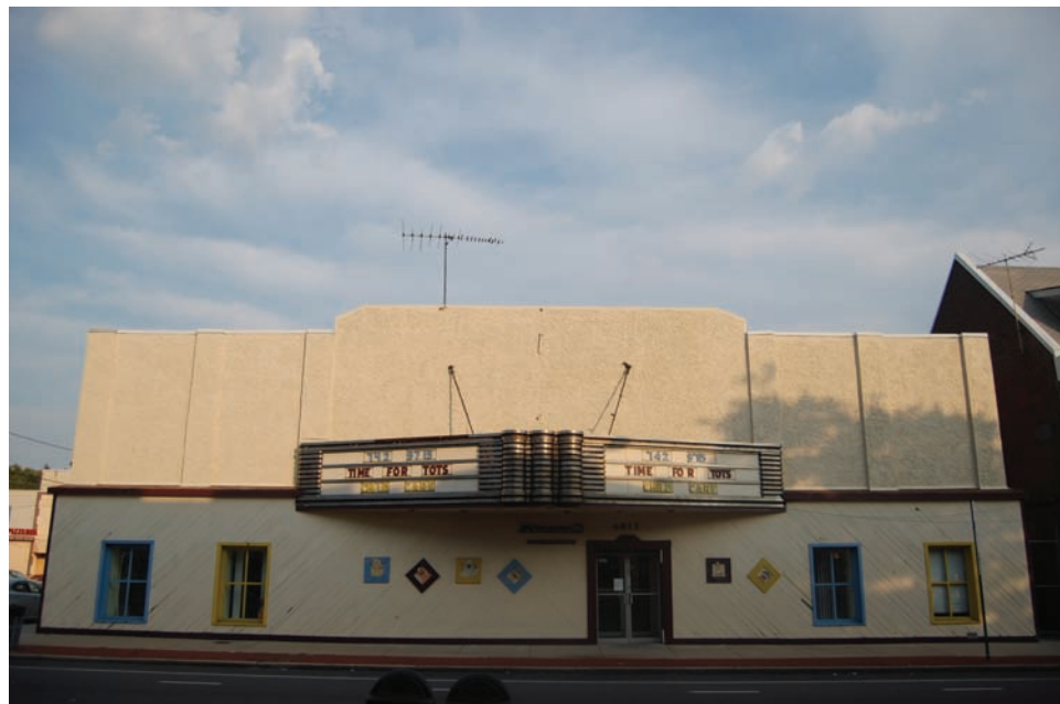
Figure 28. Lawndale Theatre William Harold Lee—Additions/Alternations (1937) Source: Glazer, 149; PAB Rising Sun Avenue and Fanshawe Street, Philadelphia