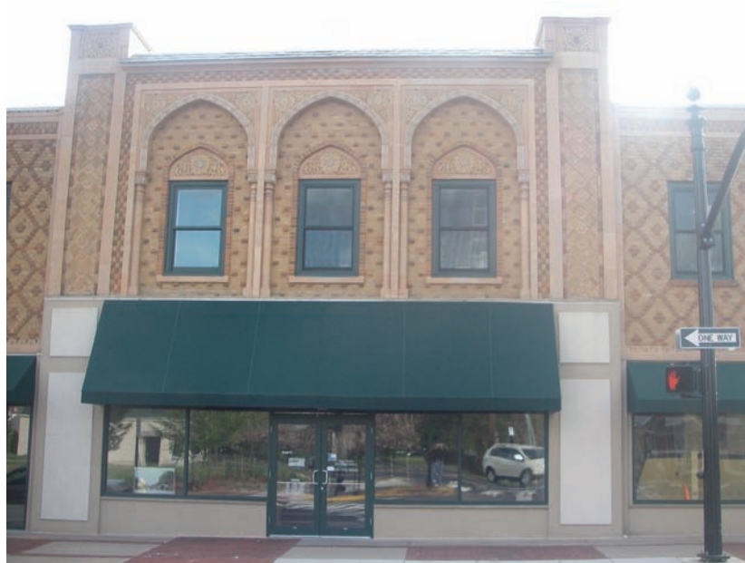
Figure 19. Grand Theatre William Harold Lee Original Architect (circa 1928) 422 Mill Street, Bristol