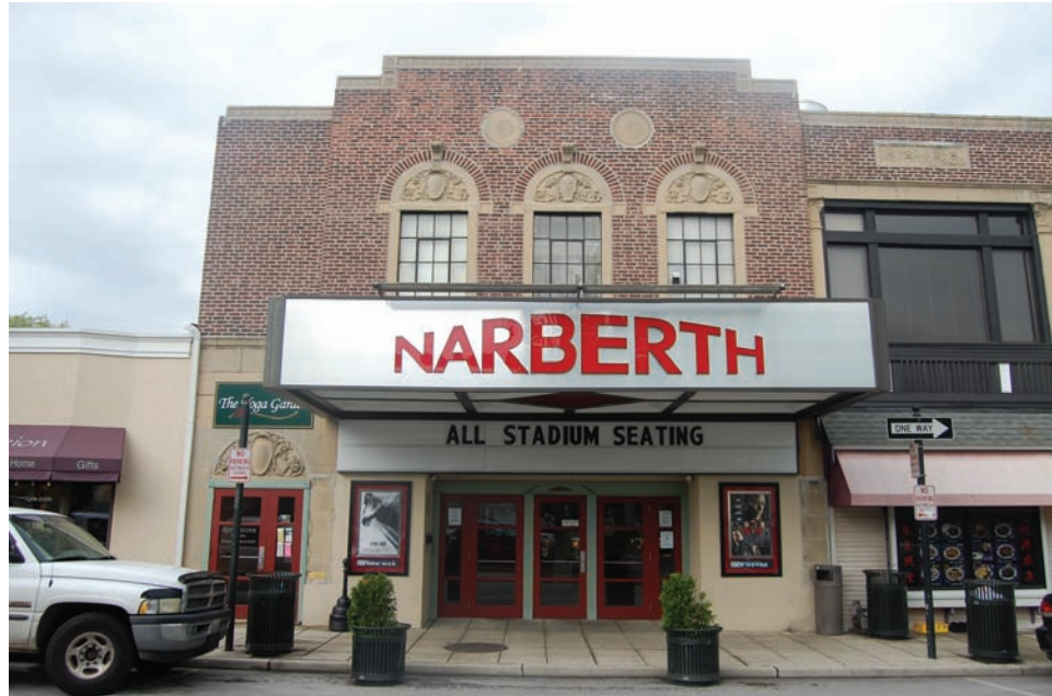
Figure 7. Narberth Theatre (After 2004 Renovations) Possible Original Architects: Jacob Ethan Fieldstein/William Harold Lee (1927) Source: Cinema Treasures—NT 129 N. Narberth Avenue, Narberth Photo by Author