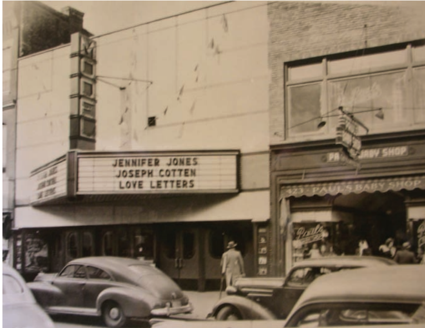
Figure 33. Model Theatre