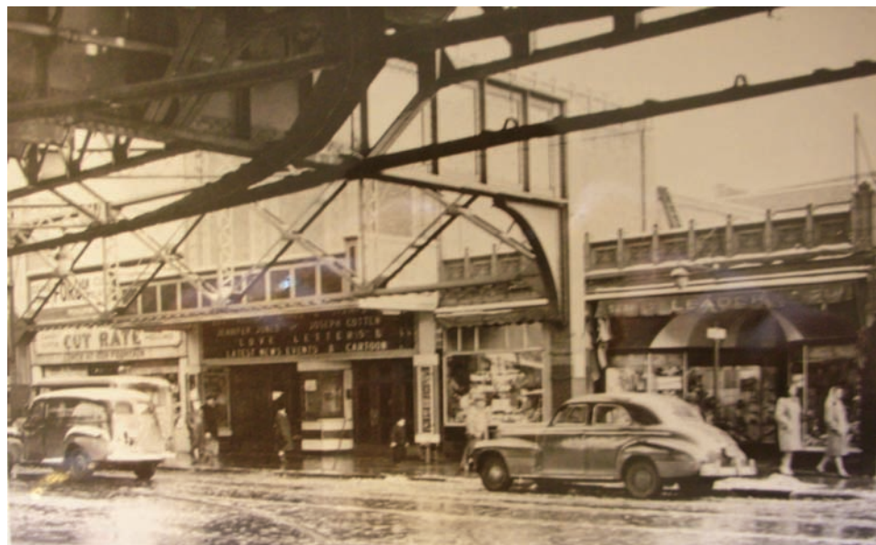
Figure 18. Forum/Ellis/Xtasy Theatre (circa 1945)