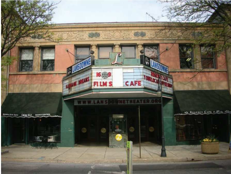
Figure 41. Lansdowne Theatre Close-Up