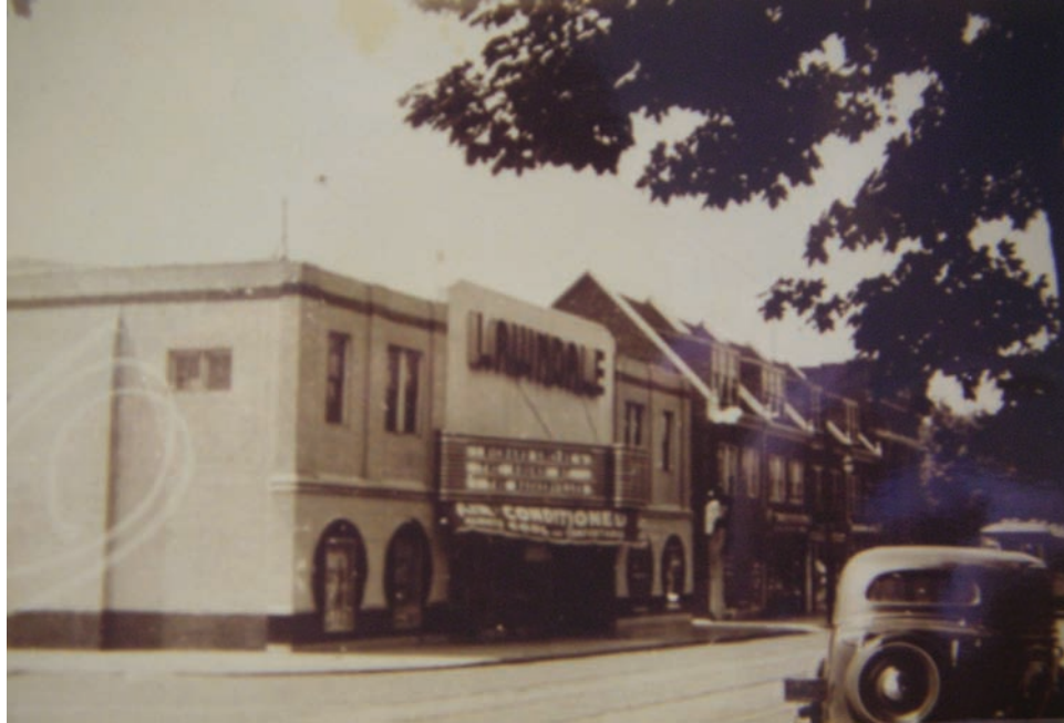
Figure 29. Lawndale Theatre