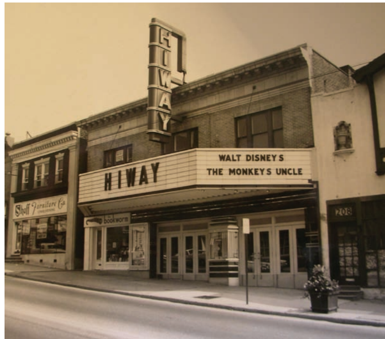
Figure 6. Hiway Theatre (1965)