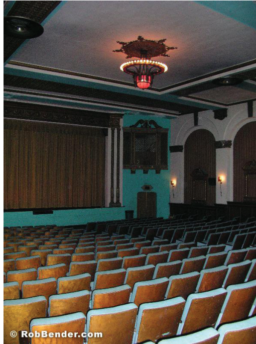
Figure 9. Narberth Theatre Auditorium (Prior to 2004 Renovations)