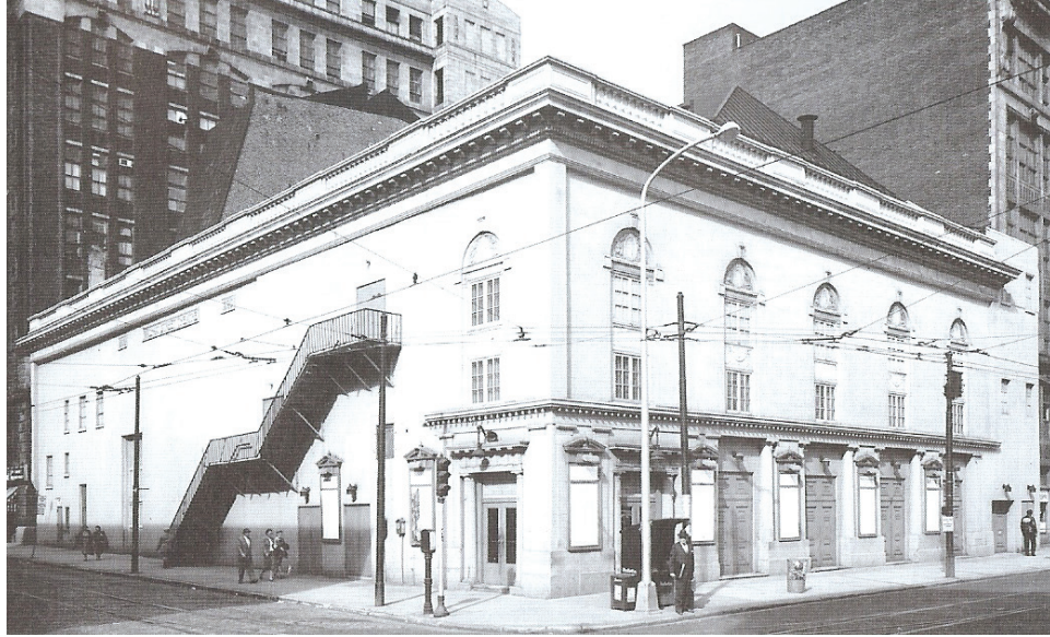
Figure 11. Walnut Street Theatre (1952)