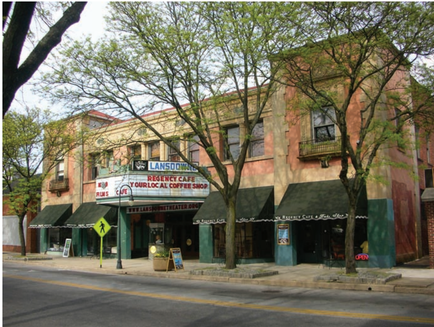
Figure 40. Lansdowne Theatre William Harold Lee Original Architect (circa 1927) Source: National Register—LT 29-33 N. Lansdowne Avenue, Lansdowne Photo by Author