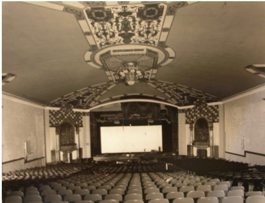
Figure 44. Lansdowne Theatre Auditorium