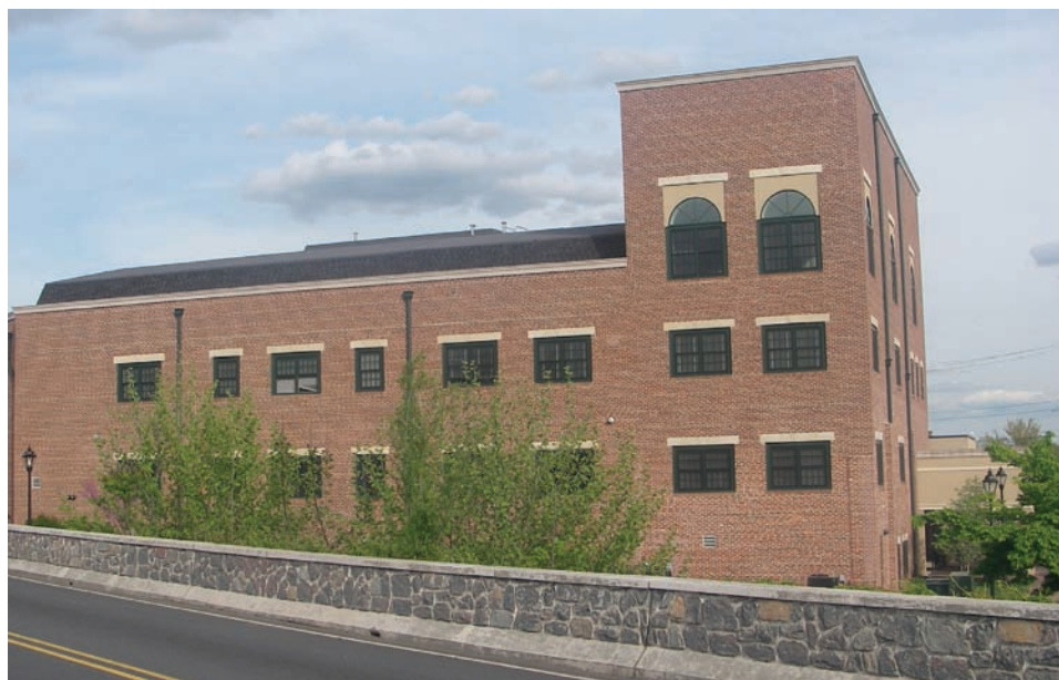
Figure 20. Grand Theatre Auditorium Converted into Housing