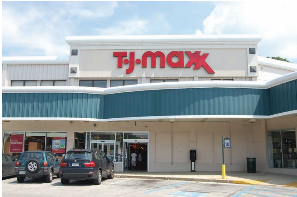
Figure 15. City Line Center Theatre William Harold Lee Original Architect (circa 1930s) 7600 City Avenue, Philadelphia