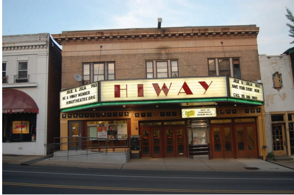
Figure 5. Hiway Theatre William Harold Lee—Additions/Alterations (1925) Source: PAB 212 York Road, Jenkintown Photo by Author