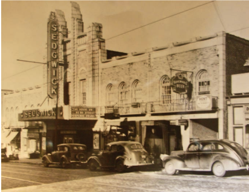
Figure 37. Sedgwick Theatre