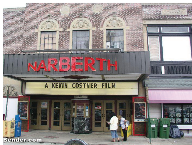
Figure 8. Narberth Theatre (Prior to 2004 Renovations)