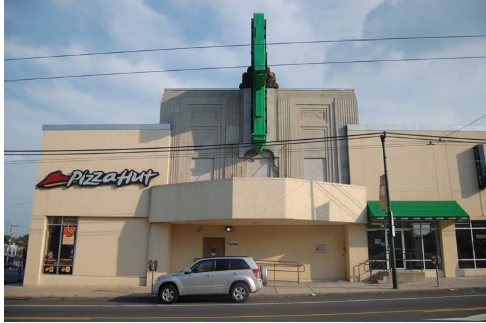
Figure 25. Holme/Penypak Theatre William Harold Lee Original Architect (1929) Source: Glazer, 136; PAB 8049 Frankford Avenue, Philadelphia Photo by Author