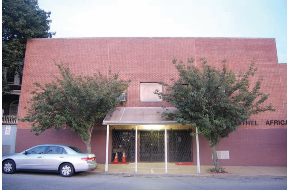
Figure 35. Rialto Theatre William Harold Lee—Additions/Alternations (1931) 6153 Germantown Avenue, Philadelphia