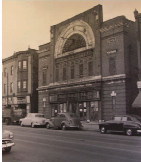
Figure 27. Jefferson Theatre