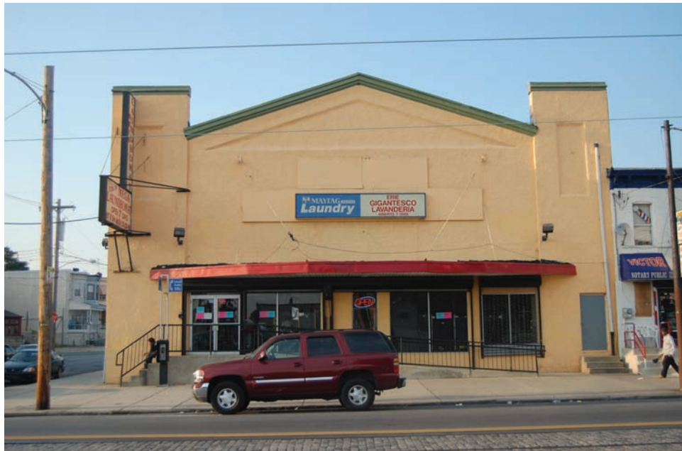
Figure 14. Century Theatre William Harold Lee—Restoration/Renovation (1927); Additions/Alternations (1938) Source: Glazer, 80; PAB Erie Avenue and Marshall Street, Philadelphia Photo by Author