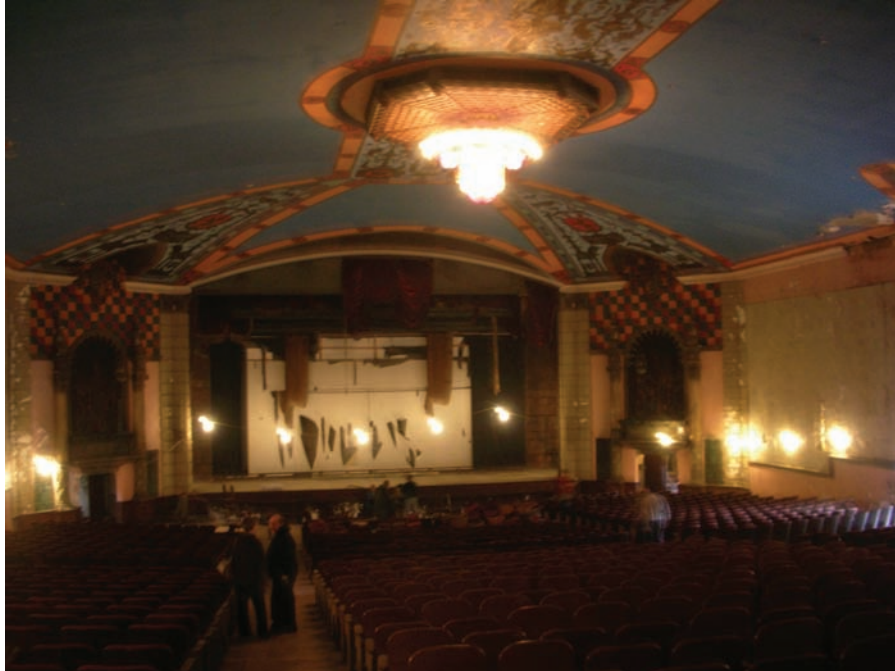
Figure 43. Lansdowne Theatre Auditorium