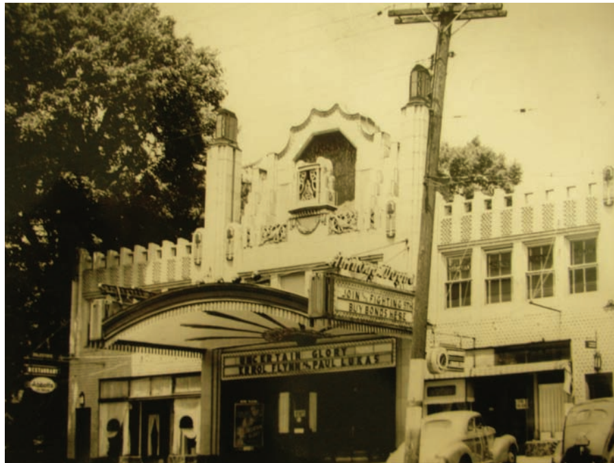
Figure 2. Anthony Wayne Theatre