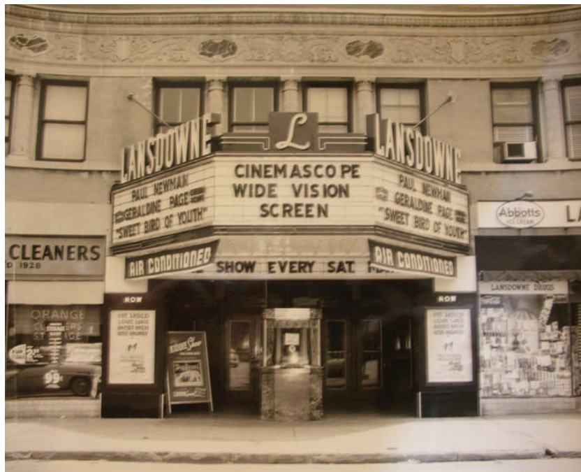
Figure 42. Lansdowne Theatre (1962)