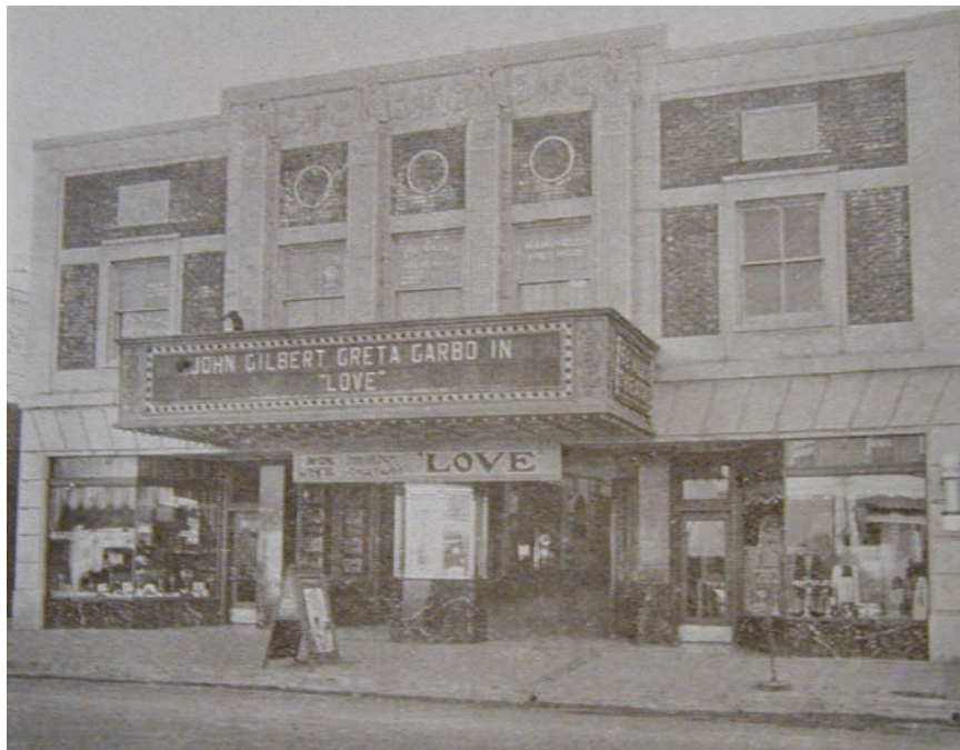
Figure 4. Bryn Mawr Film Institute/Seville Theatre (circa 1927)