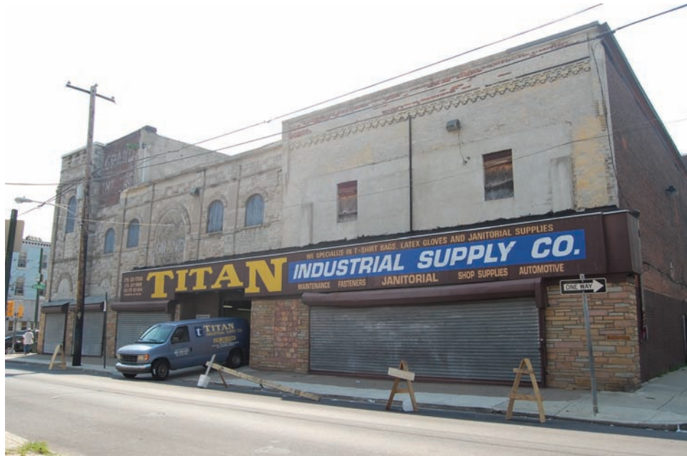
Figure 21. Grand Theatre William Harold Lee—Additions/Alterations (1937) Source: Glazer, 131; PAB S. 7th Street and Snyder Avenue, Philadelphia Photo by Author