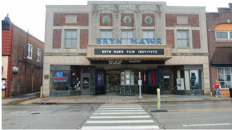
Figure 3. Bryn Mawr Film Institute/Seville Theatre William Harold Lee Original Architect (1926) Source: National Register—ST 824 W. Lancaster Avenue, Bryn Mawr Photo by Author