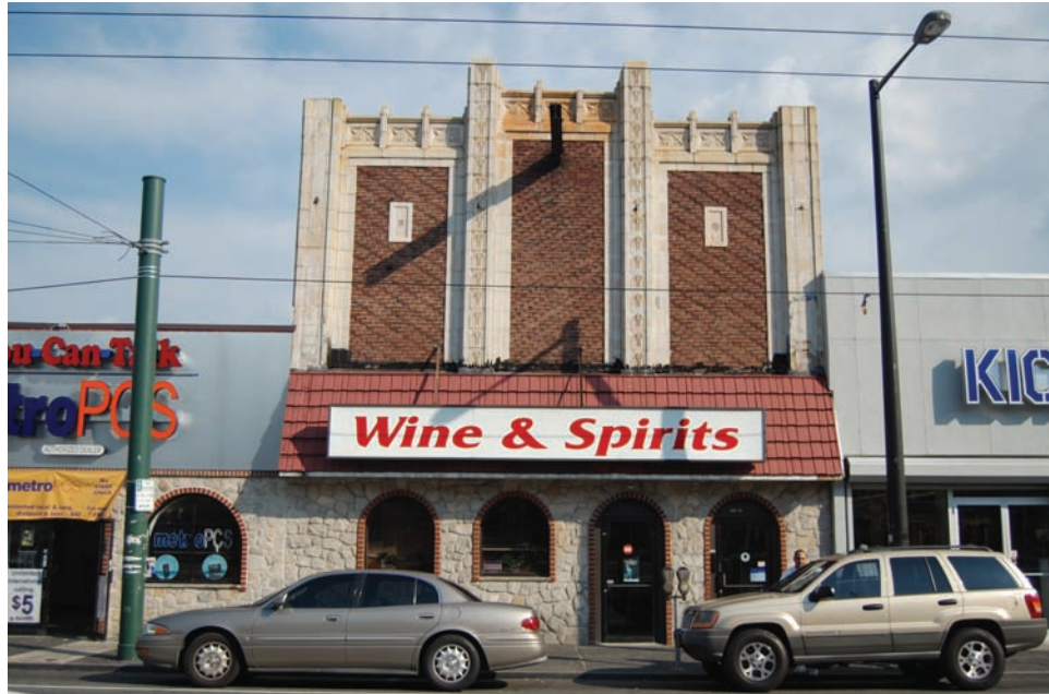
Figure 17. Forum/Ellis/Xtasy Theatre William Harold Lee Original Architect (1928) Source: Glazer, 116-117; PAB 5231 Frankford Avenue, Philadelphia Photo by Author