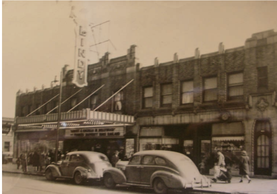
Figure 31. Lindy Theatre (circa 1945)