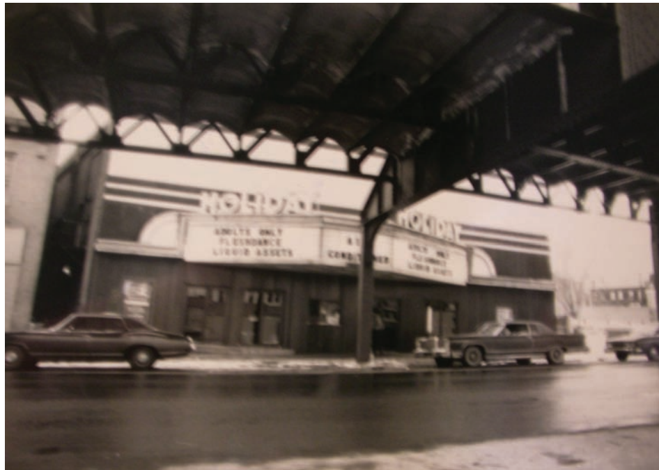
Figure 24. Holiday/Ace/Windsor Theatre (circa 1970s)