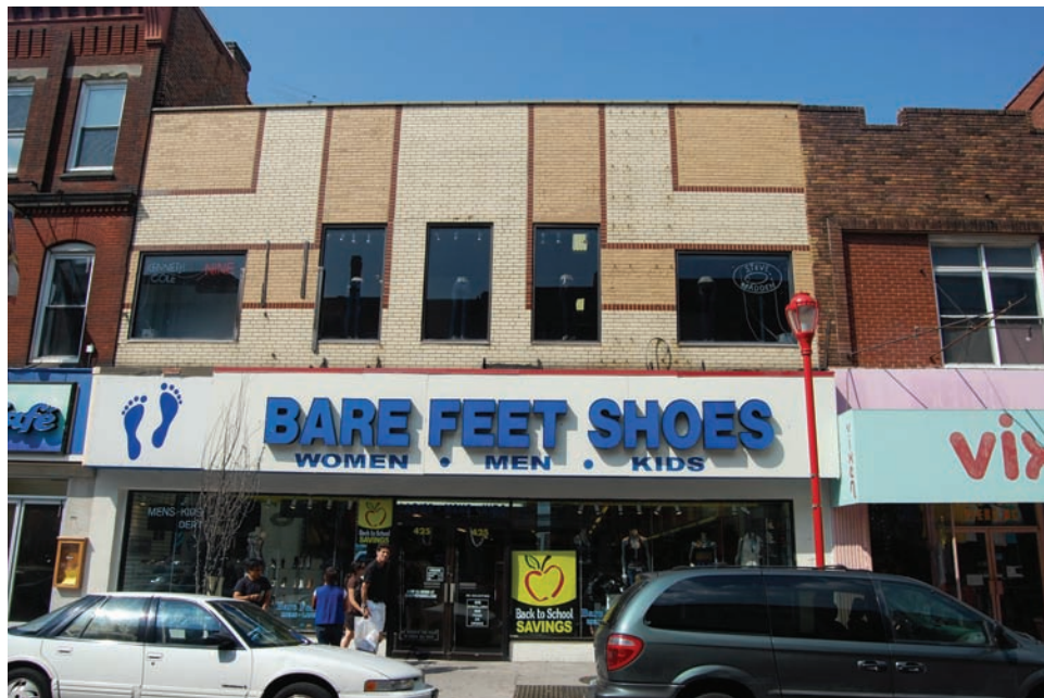
Figure 32. Model Theatre William Harold Lee—Additions/Alternations (1930) Source: Glazer, 171; PAB 425 South Street, Philadelphia Photo by Author