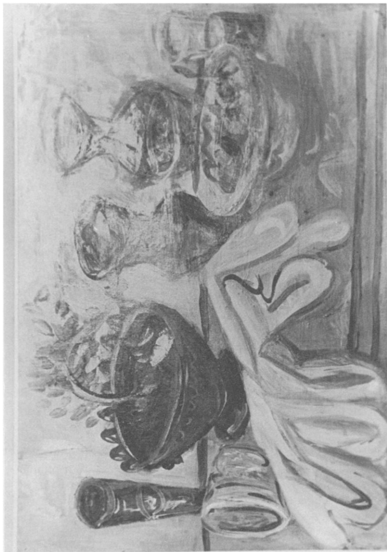
Figure 1. Pierre Tal Coat, Still Life , oil, 81 × 54 cm. Reproduced by permission of Holly Stevens and Watkinson Library, Trinity College.