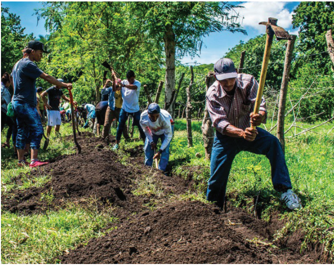
Digging water lines to homes