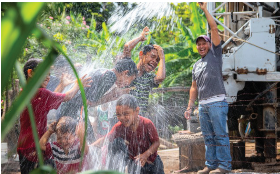
Happy faces when drilling was successful

The role of non-profit organizations in outfitting the developing world with clean water has become more extensive as the world's population grows, especially in places such as Nicaragua, the second poorest country in the western hemisphere. Nicaraguans suffer high rates of kidney disease, respiratory illnesses and parasites as a result of water borne diseases. NGOs such as Amigos for Christ are stepping in to fill the void in Chinandega where the local government lacks the financial wherewithal to provide a basic WASH infrastructure to its inhabitants. It is the goal of Amigos for Christ to bring water to every household in Chinandega thereby improving the health, education and welfare of the populace. This article is based on transcripts from an interview on how this NGO accomplishes their work.