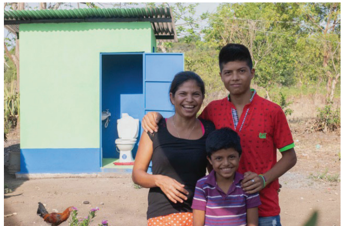
Family happy with great sanitation

In addition, we are in the process of working with Chosen Eye Mission from Texas to build a state-of-the-art eye surgery center that will be the best one in all of Nicaragua. We also host surgery teams from the U.S. for knee and hip replacements, as well as urology, gynecology, and general surgeries.