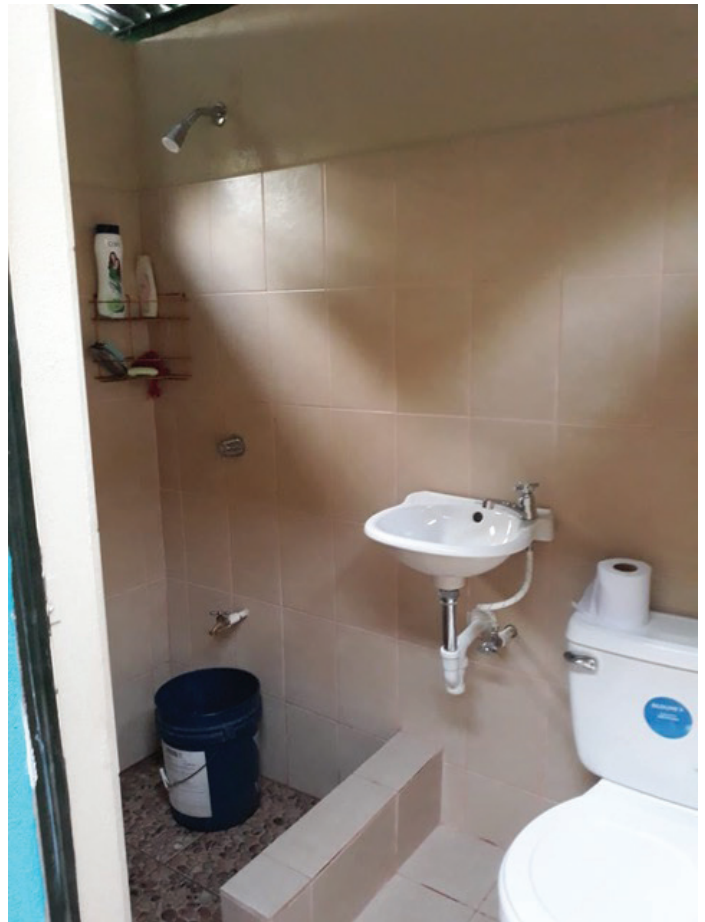
Modern bathroom in El Pedregal

Each of these goals has several activities to get us there, from testing people's poop and pee, lung capacity, urine density, etc. Our team of promoters are out spending their days working directly with community members. This partnership with communities lasts for 7 years which gives the community plenty of time to assimilate and take these projects over.