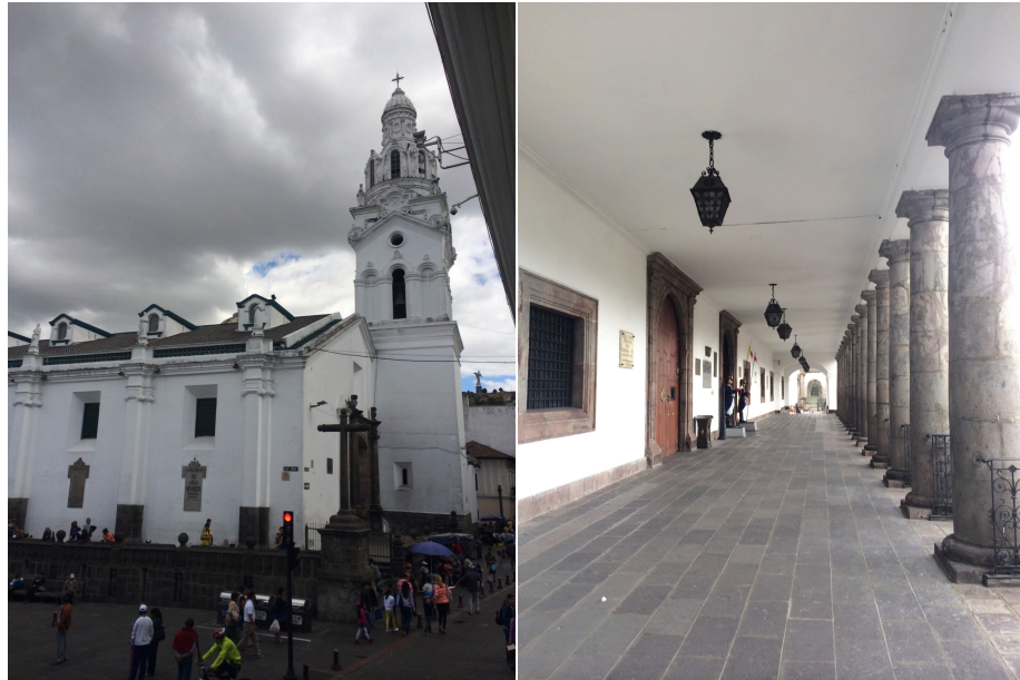
Figure 2 and 3: The Cathedral in Plaza Grande and The Governor's Palace, in the center of Historic Quito is now a peaceful tourist site, but was the site of major protests during the coup of 2000. 4

extraction, has an enormous impact on indigenous lands and rights, which will be discussed in the epilogue.