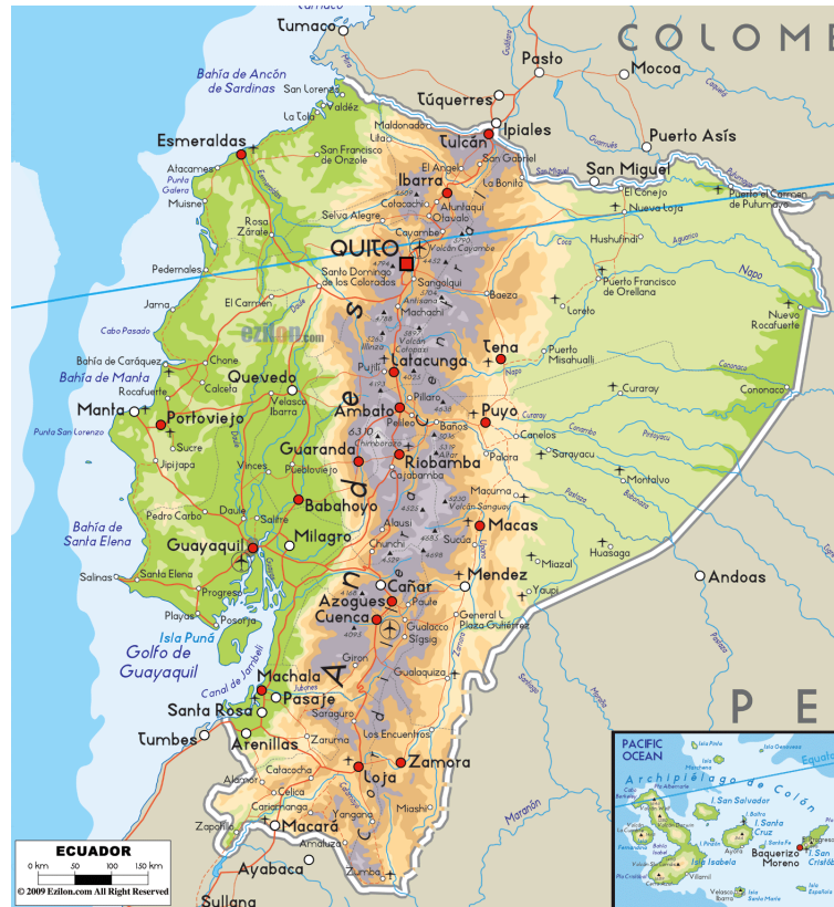
Figure 1: Physical map of Ecuador 3

Economically, Ecuador is largely dependent on oil but tourism represents a growing industry. The largest exports have not changed in decades: petroleum and bananas, though other agricultural products, including cacao and coffee, are also exported. Foreign debt and economic intervention has created a longstanding dependency problem, currently the biggest foreign investor is China and a series of world class malls recently opened in Quito, all funded by the Chinese, featuring international chains such as Dunkin' Donuts and Zara. These malls are nearly identical to their North American counterparts. The role of foreign investment, particularly when connected to resource