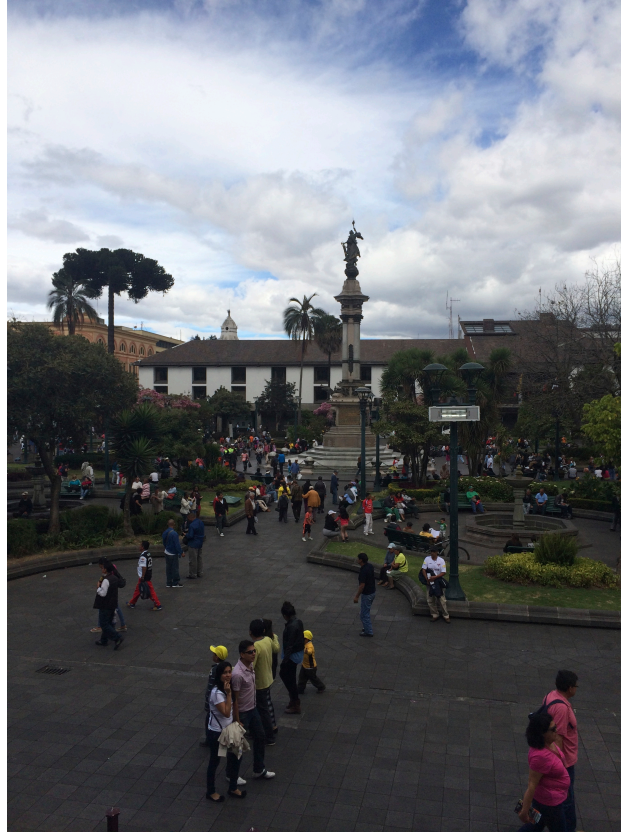
Figure 3: Plaza Mayor, Quito, Ecuador. The statue at the center memorializes independence from the Spanish and is modeled after the US Statue of Liberty. 5

Ecuador's Indigenous people are distributed across the geographic regions but often have similar issues in terms of access to services and economic opportunities, and may share linguistic roots and histories. The differences between these groups, though sometimes subtle, are crucial, especially when considering organization and strategy. Depending on their location, Indigenous groups may have centuries of experiences laboring on land they do not own or may have very minimal contact with the outside world. Either scenario would inform both organizational and content goals for education.