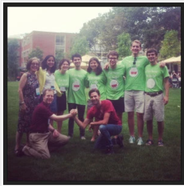
— The Squirrel Squad

SHARP was a busy four days for the RBML staff. Donning our neon-green squirrel shirts every morning at 7:00am , we helped direct, transport, and feed the over 300 attendees from Thursday morning until Sunday night. A good time was had by all, and we appreciated the thanks of many grateful scholars. During the concluding barbecue on Shoemaker Green , Roger Chartier himself was gracious enough to shake our hands and say, "thanks to all my green jerseys."