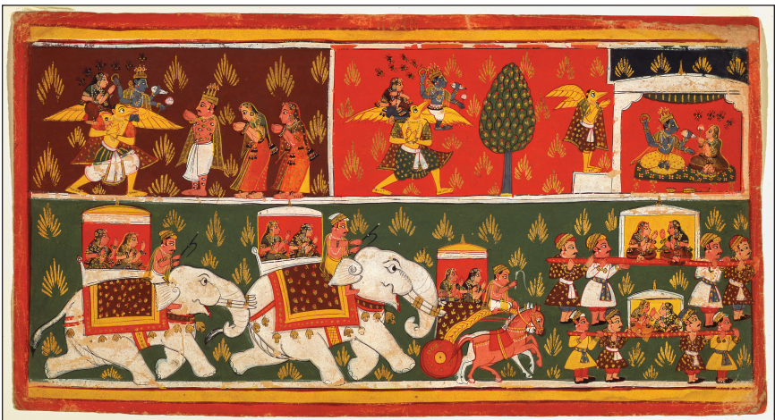
FIGURE 4. Krishna steals the Parijata tree , from a Bhāgavata Purāṇa manuscript. Central India, circa 1700. Ink and opaque watercolors on paper, 19.7 × 37.1 cm. Asian Art Museum of San Francisco, Gift of George Hopper Fitch, 2010.321.