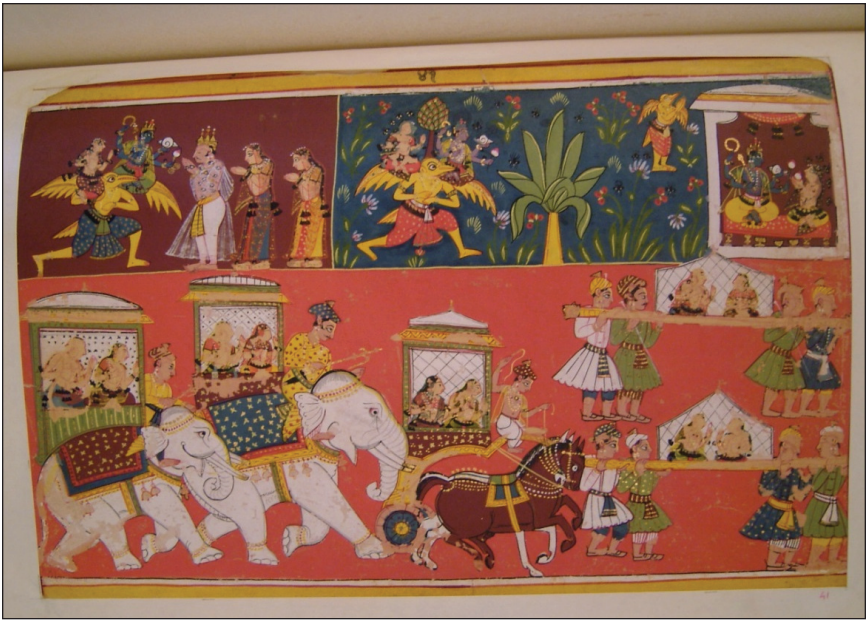
FIGURE 3. Krishna steals the Parijata tree , from a Bhāgavata Purāṇa manuscript. Central India, 1688. Opaque watercolor on paper, approximately 25 × 35 cm. Kanoria Collection, Patna.